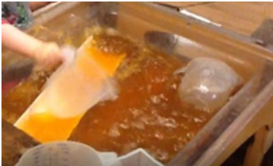
Figure 2. Video Still Water Pouring, case study one: session three

Within a minute of the enquiry, the practitioner talks, and the child responds. The talk is focused on commentary about the water and at one point the practitioner 'wonders' what might happen to the water. This is followed by a short dialogue between the practitioner and the child.