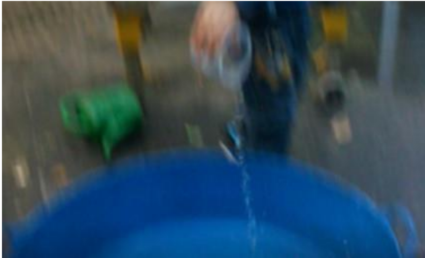
Figure 1. Video still Water Swirling , case study one: session two

Then the child slows down and pours water into the trug with careful attention. A small plastic toy pig, and later a disc, are placed in the trug and water is repeatedly poured onto them. Finally, the video footage shows the child holding a small plastic figure under a fast-running tap. There is very little dialogue in the clip and the practitioner filming has placed himself behind a small handheld camera which is shaking slightly. In the subsequent reflective dialogues, practitioners focus on the child's immersion in enquiry and the absence of talk.