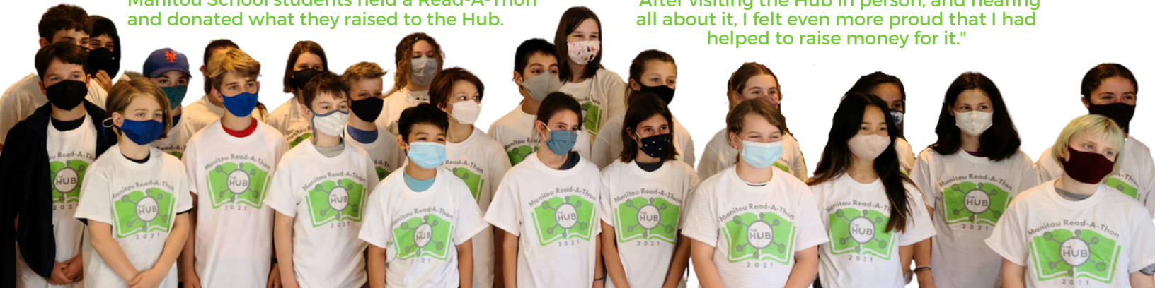
"After visiting the Hub in person, and hearing all about it, I felt even more proud that I had helped to raise money for it."

To support the Hub, please visit www.philipstownhub.org/donate or mail your contribution to Philipstown Behavioral Health Hub, PO Box 317, Cold Spring, NY 10516.