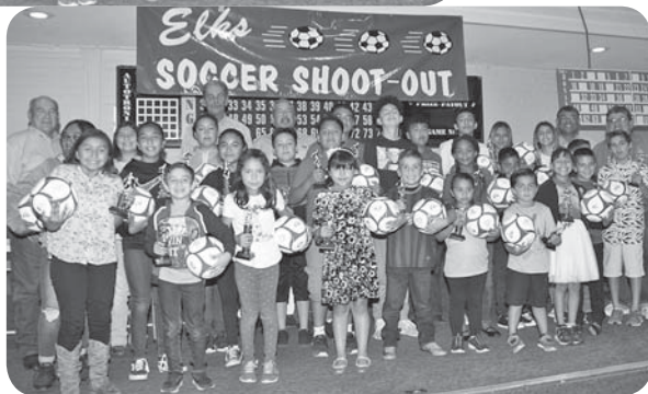
1st - 3rd Place Winners (below)