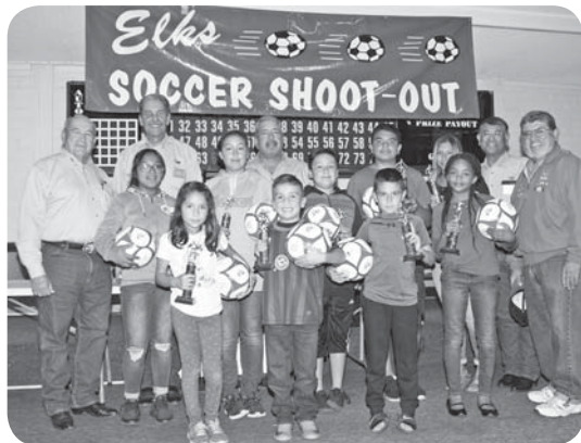
1st Place Winners (left)

The entire first through third place winners, with their parents and guests, were invited to an awards banquet, in their honor, at our Lodge on Monday, September 30th, and were presented with trophies and a new soccer ball with our Elks and D.A.R.E. Program logos.