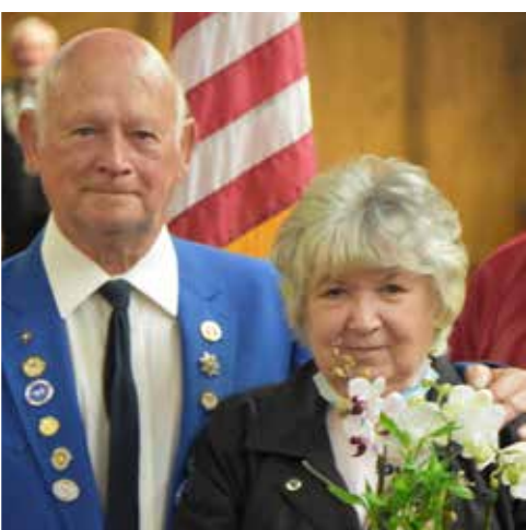
Past First Lady Bunny Gee is presented with a floral arrangement