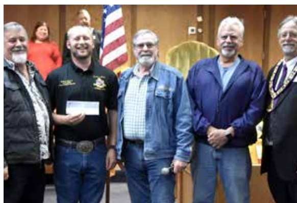
The Touring Elks Make a donation to the Wounded Warrior Project