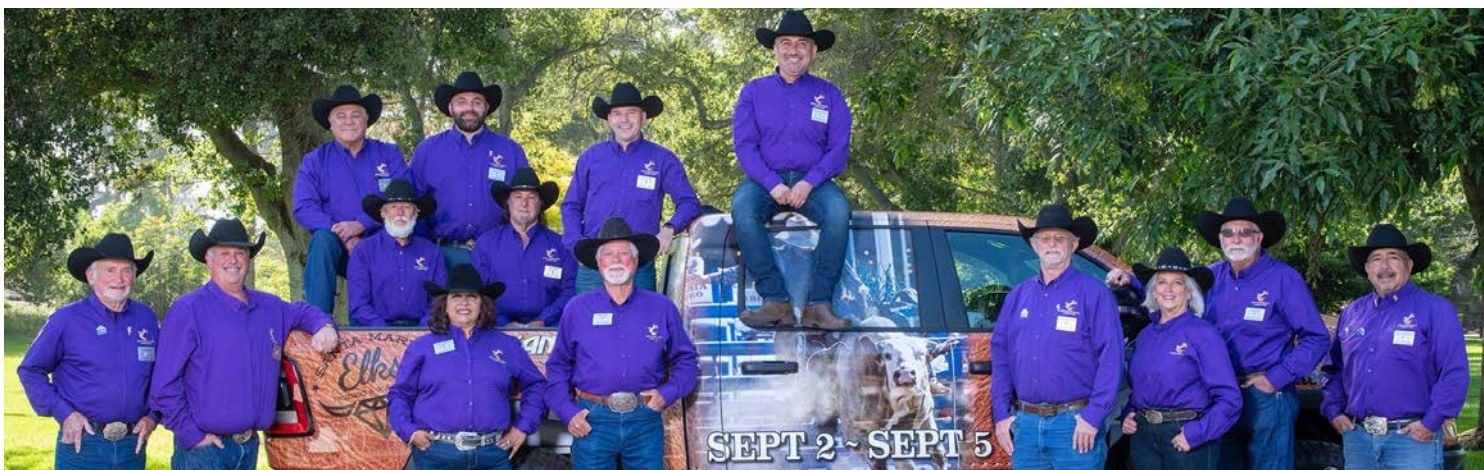
Santa Maria Elks Lodge officers are getting "Ram Ready" for our Elks Rodeo Labor Day Weekend - September 2-5 Thank you Santa Maria Chrysler for all you do for our Rodeo!