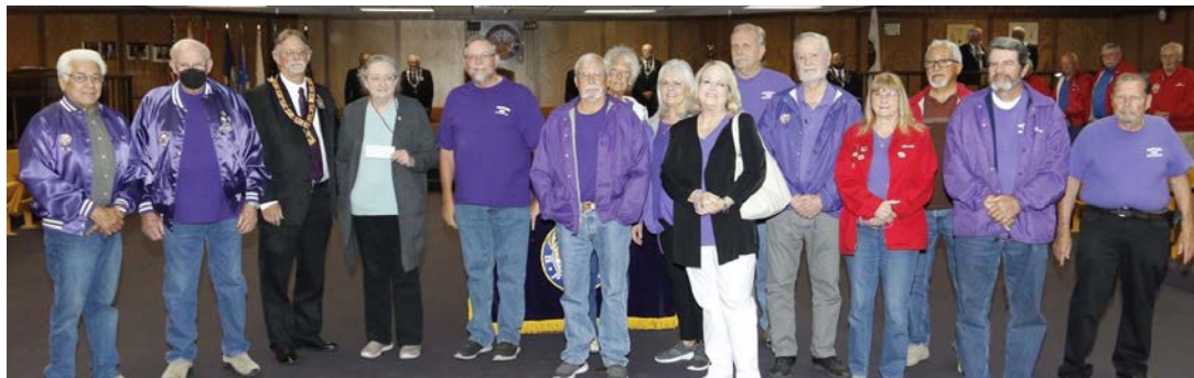
Travelers make a $500 donation to Elks National Foundation