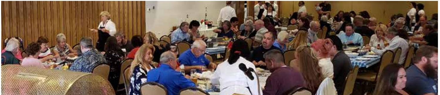
Thank you to our Members for supporting the Past Exalted Ruler's Association Student Scholarship Shrimp Peel fundraisers