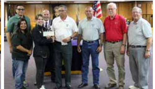
The Antlers accept a $200 donation from the Elks Golf Committee