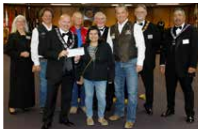
Elks Rec presents a $5,000 donation check to the Antlers for their help during the Rodeo, Haunted Hills, and Christmas in the Country