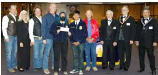
Elks Rec presents a $500 donation check to Santa Maria FFA for their help at the Rodeo Grounds