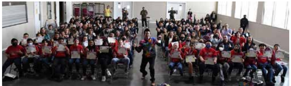
Graduation Ceremony held at St. Mary's School