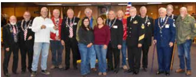
The Past Exalted Ruler Association presents Touring Elks a $1,000 donation for Toys for Tots