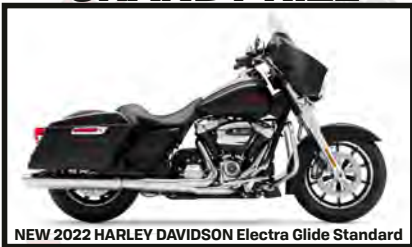
NEW 2022 HARLEY DAVIDSON Electra Glide Standard