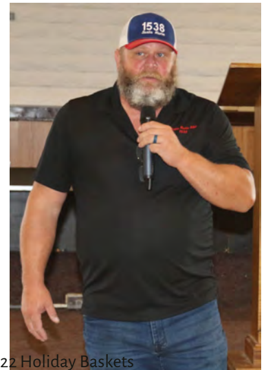
2022 Holiday Baskets