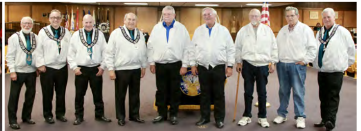
The Past Officers of the Year await their new inductee