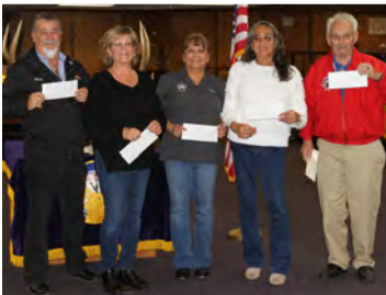
$100 Attendance Winners for attending Lodge on Beer & Peanut Night