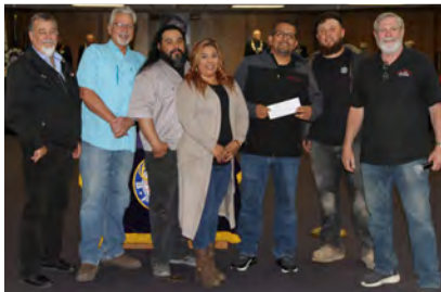
Touring Elks donate to support the Northside Little League