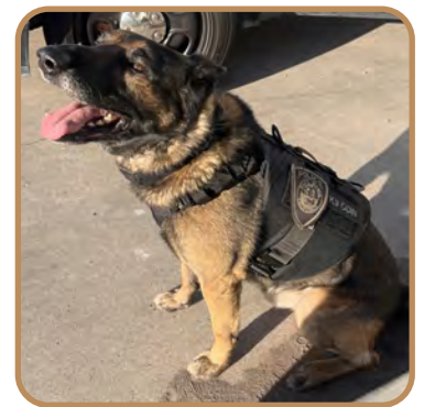
K9 Odin displays the K-9 vest purchased from the Lodge fundraiser October 1, 2021