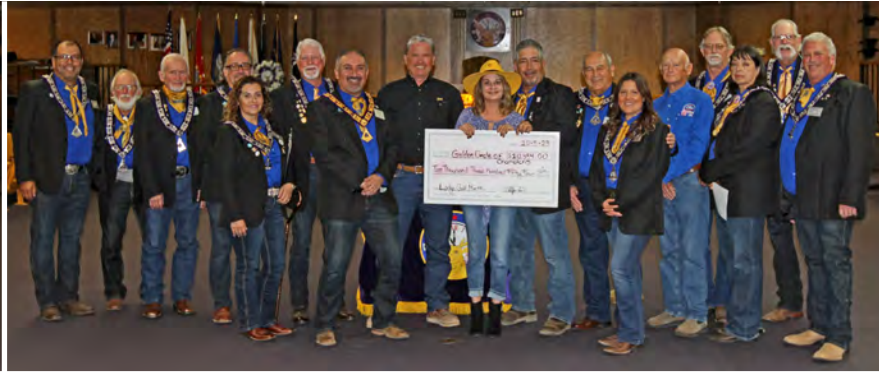
The Lodge Officers present $10,354 collected from CYO raffles, Committee Donations, Gold Ribbon sales, and a Lodge donation to the Golden Circle of Champions