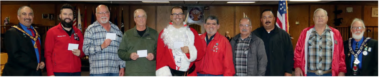
$50 Attendance Drawing Winners (listed in the Crying Towel)