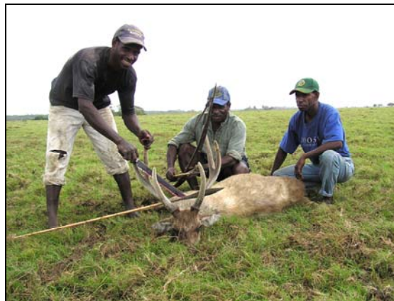
Success. The open-terrain dwelling Rusa deer is a common quarry for PNG tribal bowhunters and, yes, that's an arrow, not a spear!