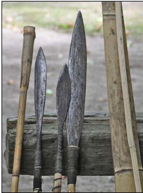
A contemporary small game blunt arrow (L) and 'broadheads'. The terminal end of the blunt is concave.