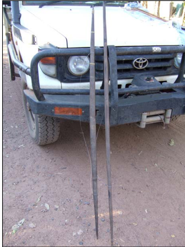
The pre-WWII era black palm bows.

The older bows are carefully crafted and carried flat, braided strings of plant fiber, though most of their string is now missing. One of the early-era bows is a bit over sixty-three inches long, the other a shade over sixty-seven inches. Because of the age and rarity of the bows stringing them was not feasible. Feeling the floor-tiller and comparing it to my own 82# longbow I estimated the draw weight of each to be approximately 80 pounds.