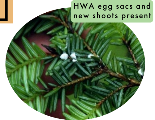
HWA egg sacs and new shoots present

Check undersides of branch tips that are within reach and fallen branch tips on ground for white woolly balls