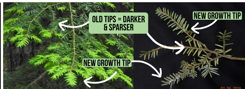
OLD TIPS = DARKER & SPARSER

New Growth Tips: Presence of bright, lime green, tender branch tips, most visible late May-early July. New shoots may persist in tree tops (use binoculars to assist). Check on the ground for canopy samples. After July, all needles are the same colour, new are in better condition (more full) with fine texture twigs.