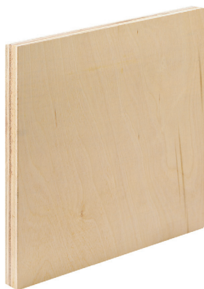
19mm Prefinished Maple