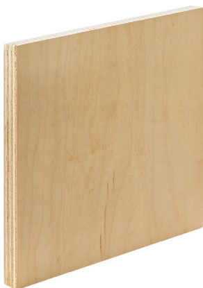
19mm Unfinished Maple

After several generations of refinement, PREMCORE®Plus delivers a superior quality at competitive prices. Evolving on our Premcore® line, Premcore®Plus has gone through several generations of refinement to where it is today with better strength and a lighter weight. Premcore®Plus is ideal for cabinet and furniture component manufacturers looking for an excellent core and lighter weight.