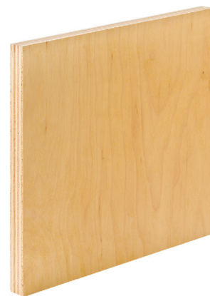
19mm Prefinished Birch