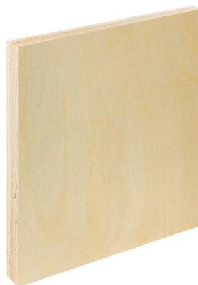
19mm Unfinished Birch