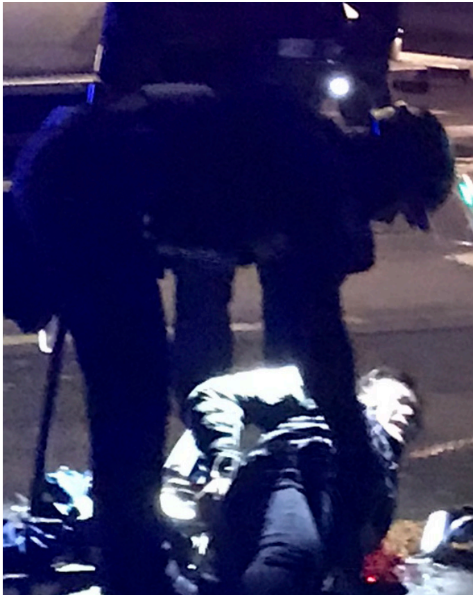
June 30, 2020. Protester forced to the ground and arrested by Portland Police, near the Portland Police Association building.

"And so folks were hiding and dropping on the ground and personally? I was crying and having a panic attack I honestly didn't predict. I really thought it mattered whether I was peaceful or not. But it didn't. I almost got hit in the head with a flash bang coming FROM the direction we were being told to go. I finally got it when I realized that the cops could do anything they wanted to me and it wouldn't matter because I had confirmed I was a bad person by overstaying my welcome. Glad I got home safe, but I won't be able to look at any cop the same way again." (June 7, 2020)