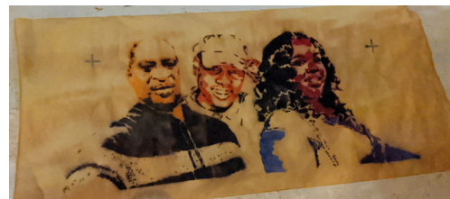
Killed by Racism George Floyd, May 25, 2020 Ahmaud Arbery, Feb, 23, 2020 Breonna Taylor, March 13, 2020

What these testimonials demonstrate is that police violence is a form of hate violence. Local, state, and federal law enforcement are inciting and escalating violence indiscriminately against the overwhelmingly nonviolent assembly of people calling for an end to racism and police brutality.