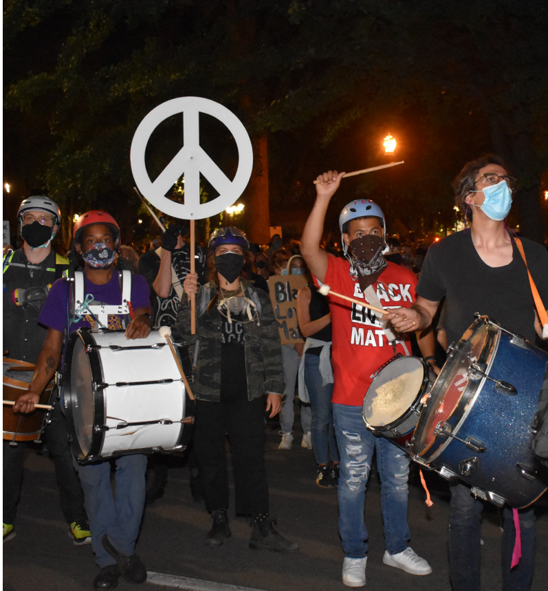
Drummers uplift the energy of protesters on July 25, 2020.

Furthermore, we would like to uplift the PUAH initiated and community-supported list of demands from nearly 1,500 sign-ons, including 1,300 individual signatories plus 66 organizations and leaders and 92 clergy. The list was sent to Mayor Ted Wheeler on July 16, 2020. The full list is presented on the following page.