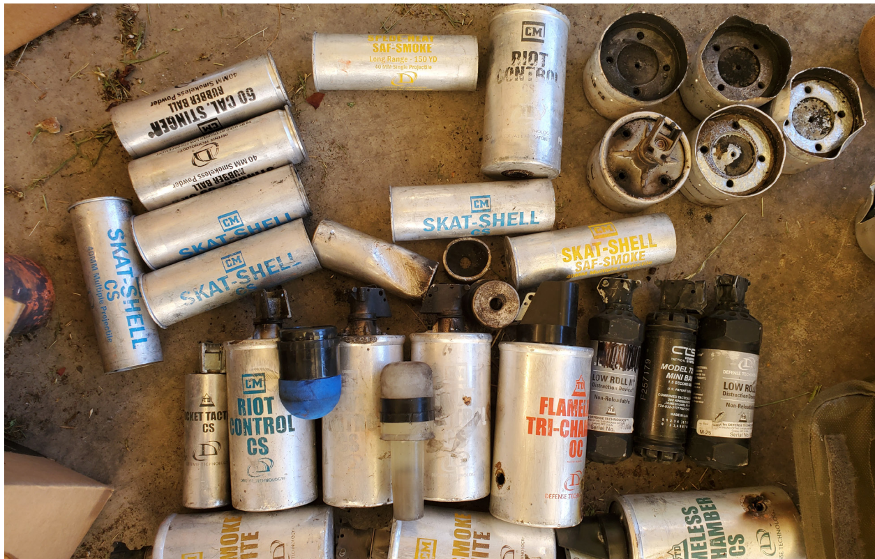
July 17, 2020. Some of the munitions fired on protesters in one night.

“The Portland Police Bureau...has responded with indiscriminate, unchecked, and unconstitutional violence against protesters... In particular, PPB has repeatedly used chemical agents (‘tear gas’) against crowds of protesters, including plaintiffs who had committed no criminal acts, posed no threat of violence to any person, and were merely engaged in protected speech.”