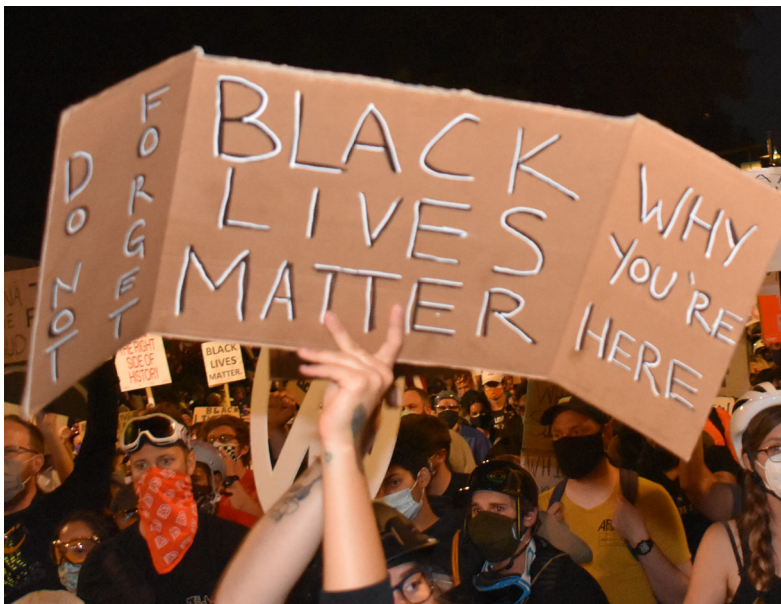
Protesters consistently displayed Black Lives Matter signs in support of the movement on July 25, 2020.

The incidents were reported to PUAH by clergy, legal observers, medics, and protesters themselves. Twenty incidents (57%) were reported by the target of the hate, six (17%) by witnesses to the incident, and nine (26%) by others, including PUAH staff to whom incidents were verbally reported. The targets ranged from 16 to 62 years old. Seven (20%) of the targets are women, sixteen (46%) are men, one (3%) is genderqueer, and ten (29%) did not report their gender. Eleven of the targets (31%) are BIPOC, twenty-one (60%) are white, and three (9%) did not include their race/ethnicity. We are mindful that the majority of incidents reported on ReportHatePDX are from white protesters, and that the experiences of Black protesters, in particular, are less represented in this report. While reports from the ground and our data confirm that “less lethal” munitions are indiscriminately used as a crowd control measure, we recognize that Black folks have long been the targets of police violence in Portland and across the country.