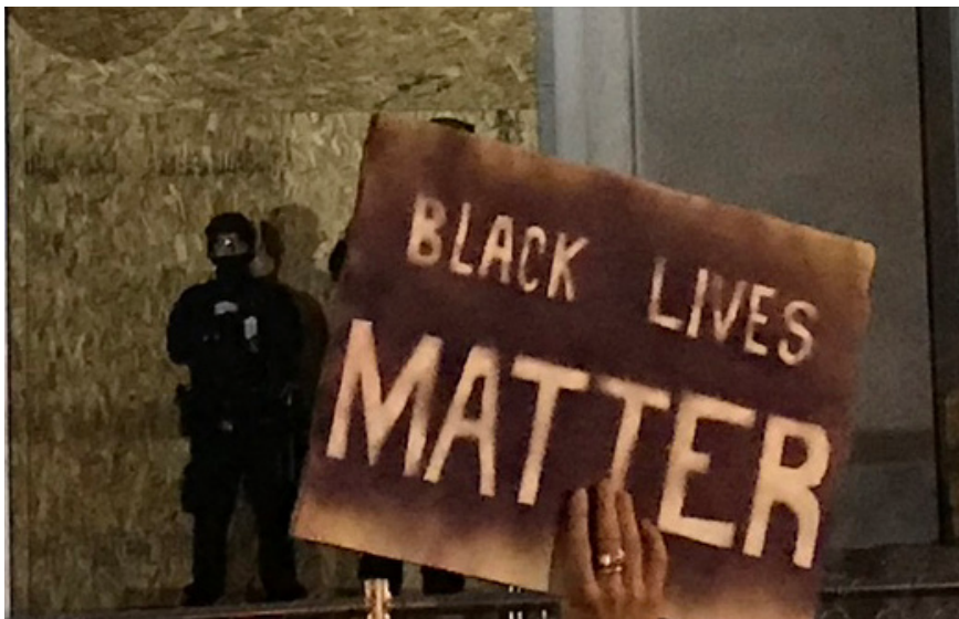
June 15, 2020. Portland Police stationed in riot gear in front of the Justice Center in Downtown. Shortly after the gathering of non-violent protesters was declared an “unlawful assembly,” police dispersed protesters with crowd control munitions.

We call on city and elected officials to end the use of indiscriminate force by law enforcement against all protesters exercising their First Amendment rights. The specifics of this call are in Appendix D.