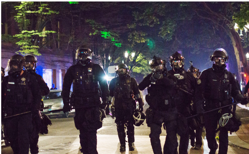
Portland Police point a gun at protesters.

“I thought I had some idea of what to expect. But I had no lived context for natural disaster and war. While witnessing at the Justice Center, nonviolent protesters were advised criminal acts were taking place. We had to leave or we would be criminals. We thought, “Why do we need to leave? Nothing feels violent.” But too many ignored warnings about shaking a fence and throwing water bottles onto concrete and time was up. And then my body tensed seeing police cars come with police in riot gear come towards us holding various weapons. We walked at a reasonable pace (no panicking - we aren’t bad people - we are “good people!”), and the police start hitting at us with flashbangs. Are we getting bombed? How can I listen and respond while I’m being bombed? Is the gas coming? The rubber encased metal bullets? I’m crying, even though I don’t want to cry. I’m screaming because I can’t help but scream. But I feel like my deepest clarity was when I understood that there I could not be good enough for these police to see me as a person instead of a criminal. Violence is dehumanizing and traumatic. It is unacceptable for police to use these tactics to kill unarmed Black people or silence protesters who will change this system for the better.” (June 7, 2020)