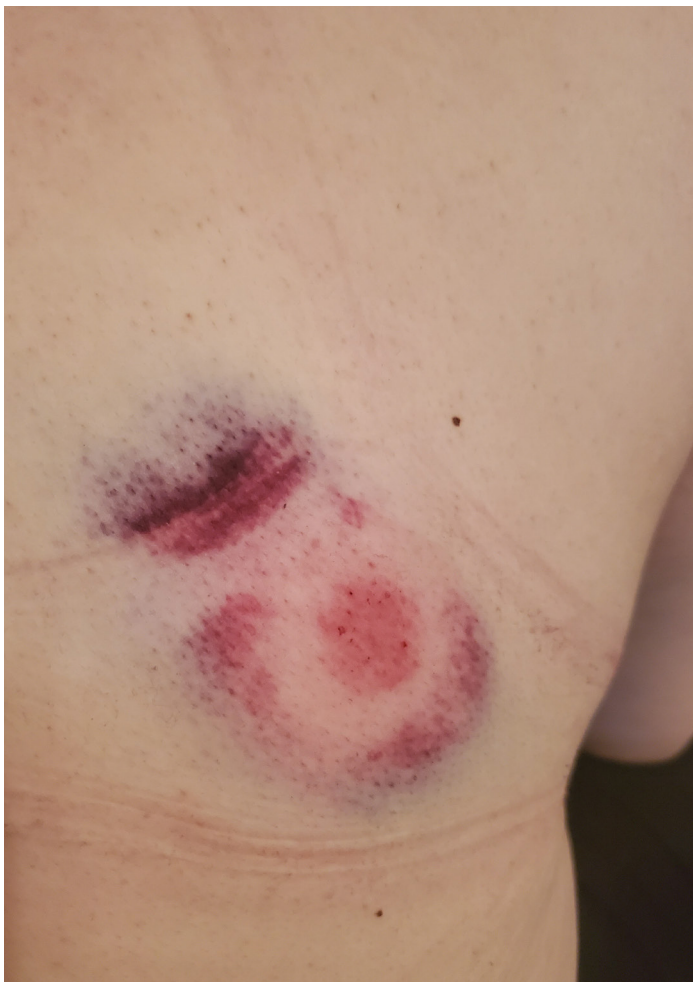
July 16, 2020. A medic was shot in the back with a rubber bullet while aiding a protester.

Eight ReportHatePDX accounts included details of what we call serious physical injury. These are injuries for which many people seek medical attention. These include twitching and mental impairment for hours after exposure to gas; witnessing a person needing to be taken by ambulance; a deaf protester losing track of their interpreter and becoming extremely dizzy to the point of needing help walking; being unable to work for two days after exposure to gas; rubber bullet to the knee joint; a rubber bullet wound becoming infected and requiring antibiotics; a laceration and probable concussion after being shot in the scalp with a plastic covered metal ball bearing; and a broken arm.