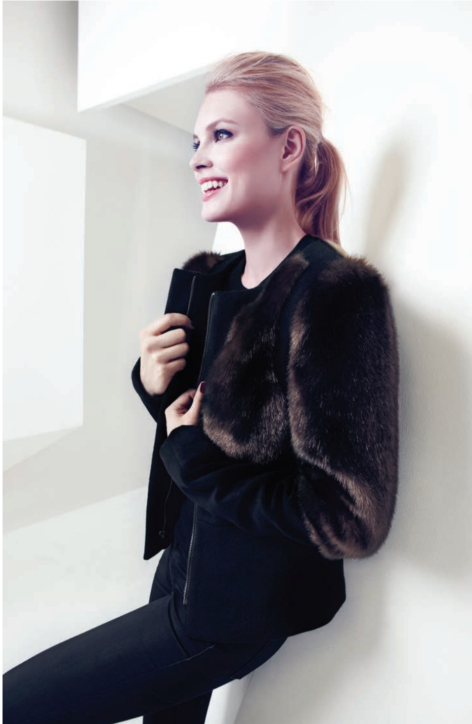
23035 faux mink