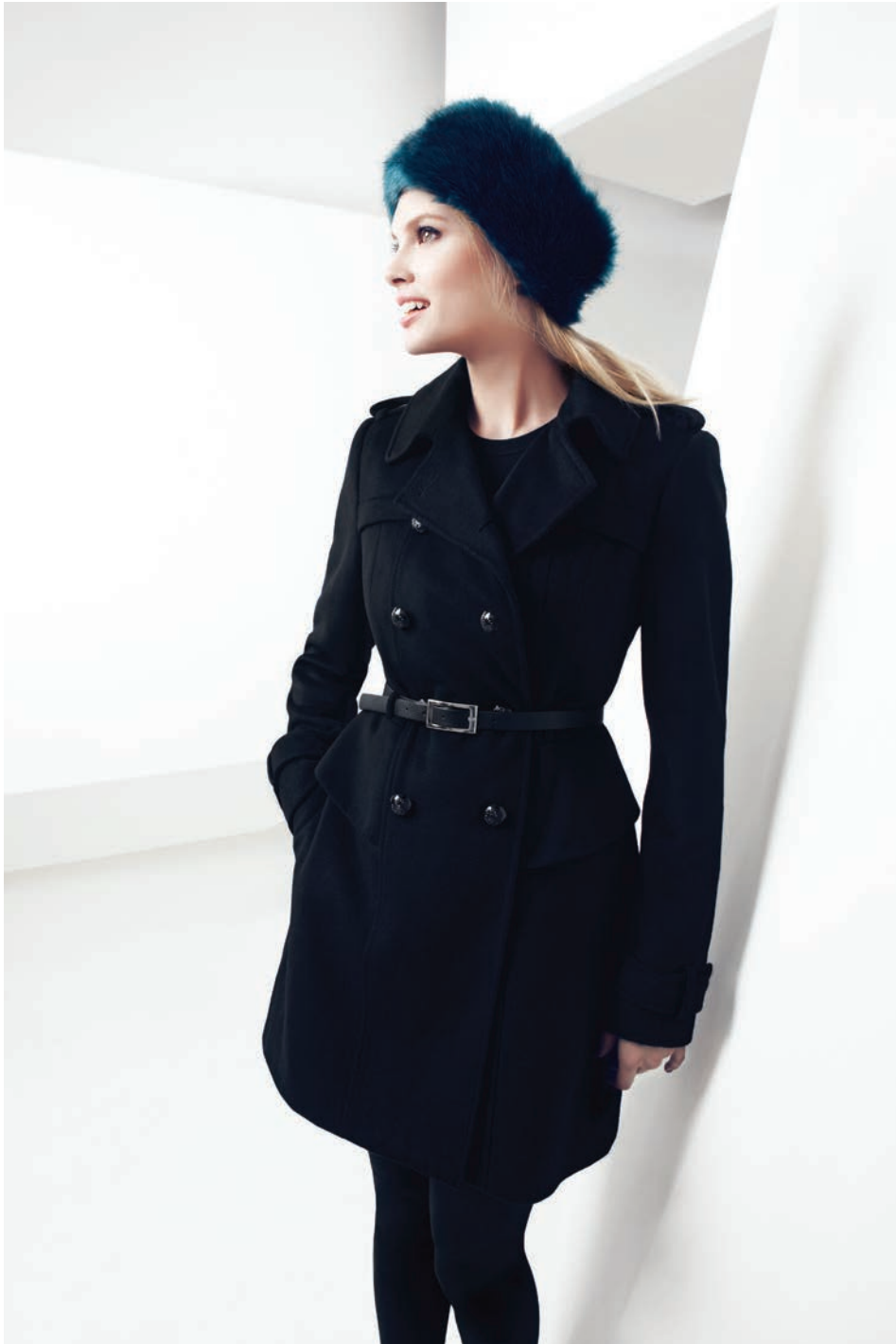
H-LD-3168-98 faux fur headband