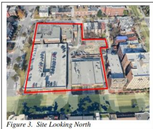
Figure 3. Site Looking North