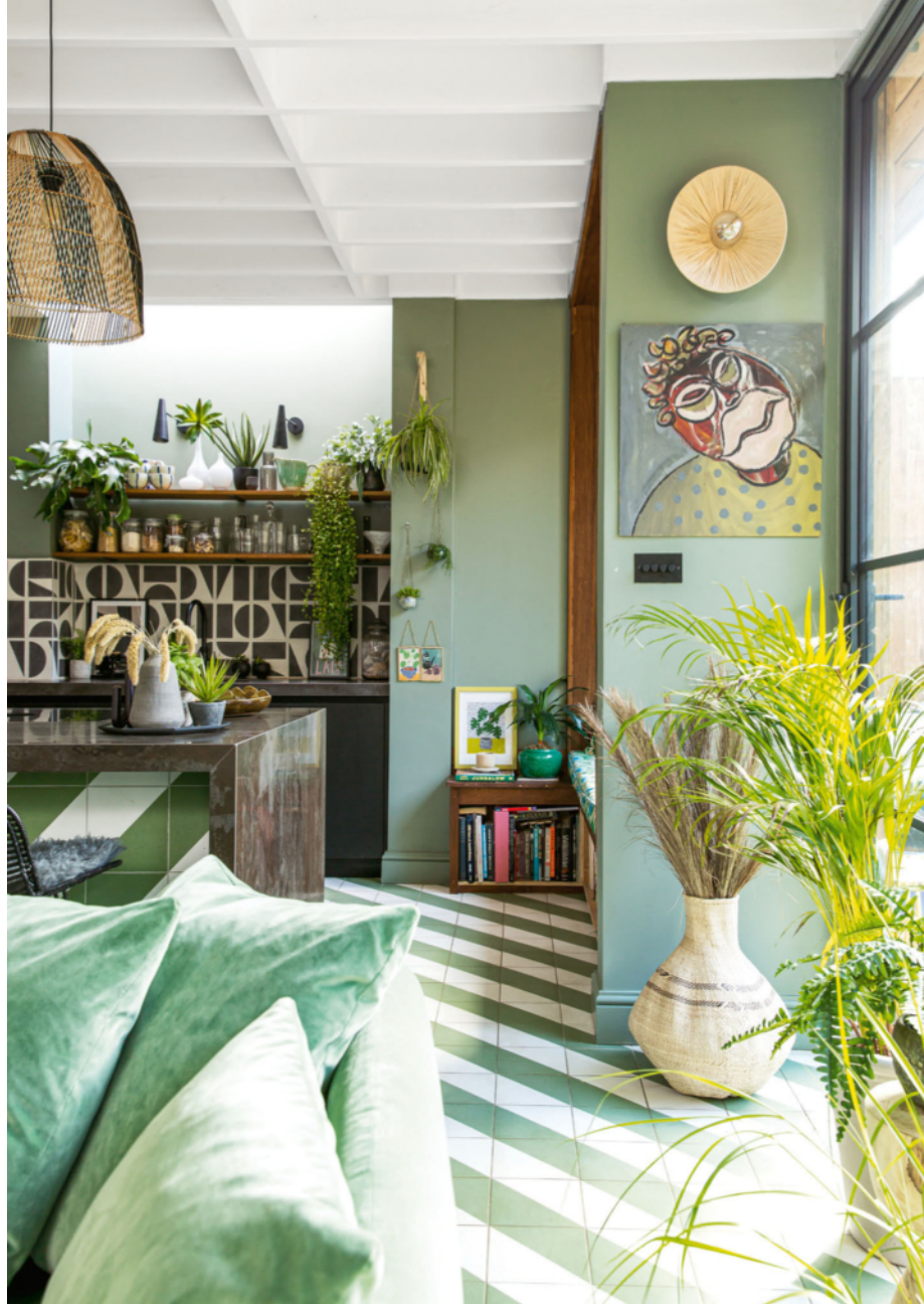
RIGHT Diagonal striped floors draw the eye into the kitchen and add a sense of drama to the space. The hard-wearing porcelain tiles have been sealed to make them easier to keep clean. Green Alalpardo porcelain floor tiles, £78.43sq m, Bert & May

“At first I was worried about being too bold for when we come to sell in future but then I realised this is our house for enjoying now”