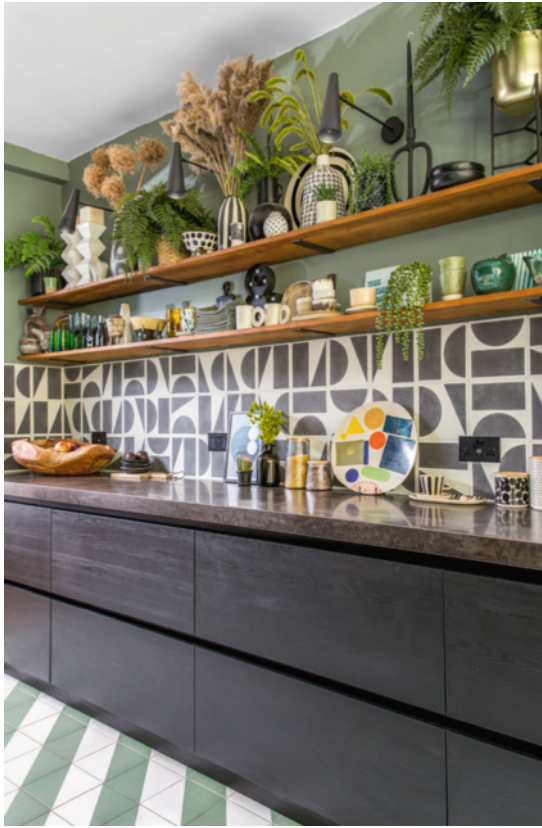
ABOVE 'I had my heart set on a black kitchen with contrasting tiles to add drama. One wall has shelving to display my collection of crockery.' Shadow Black Egger cabinetry, £23,000, The London Kitchen Company. House Doctor wall lights, £73.10 each, Royal Design.