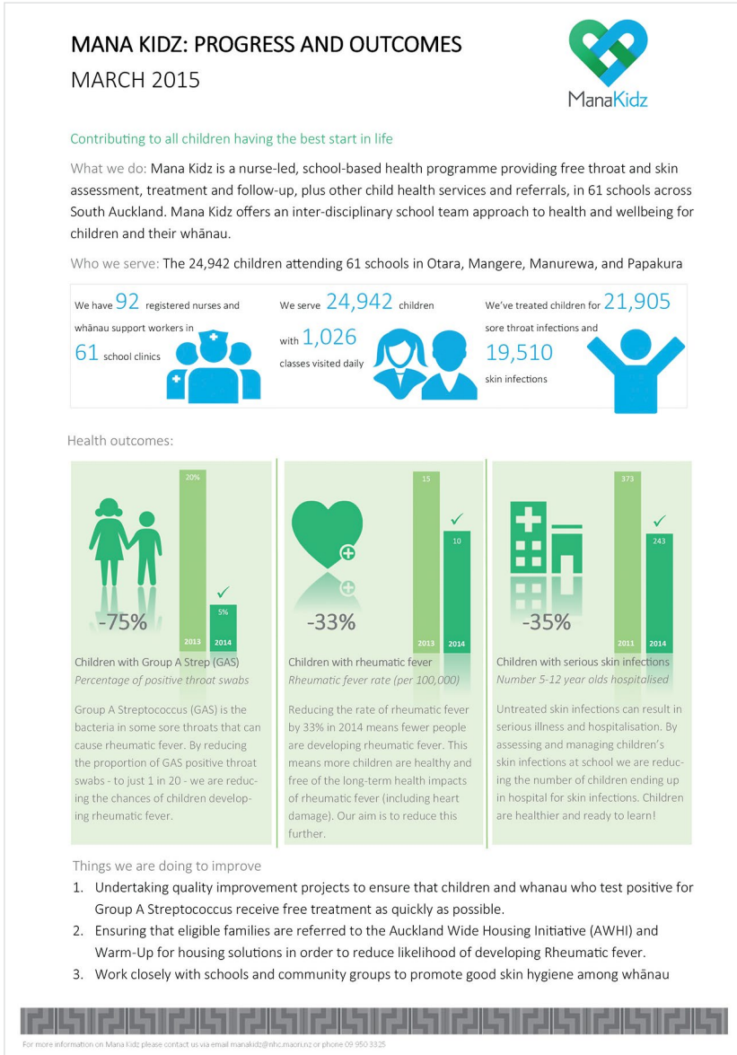
Figure 11.1 Mana Kidz data scorecard

Participation and progress are monitored via a regularly updated Mana Kidz scorecard (Figure 11.1), which ensures that children and whānau who test positive for GAS receive speedy treatment and that eligible families are referred to the AWHI for housing solutions to reduce the likelihood of developing rheumatic fever.