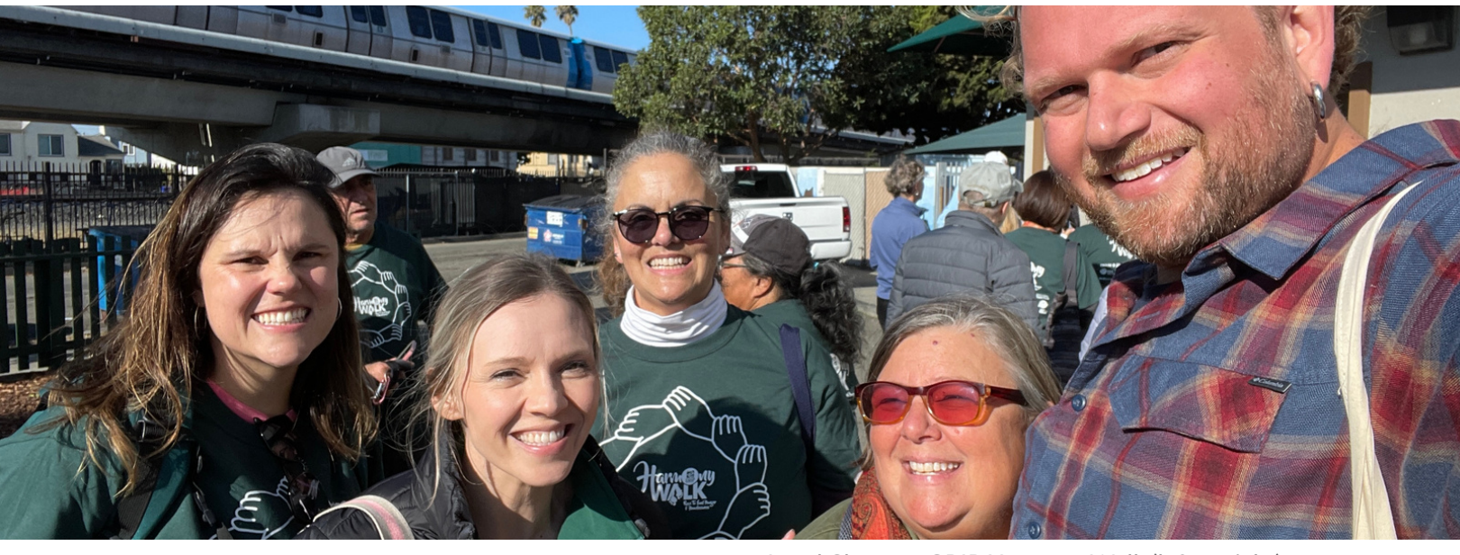
The Good Table Café & Nursery News by Melinda V. McLain

After at least nine months of waiting and making various changes, finally we received approval from the building department of our 98-page plan set so that we can move forward again. We've also signed a contract for the installation of fire sprinklers and are now working to get our Sam White \circ f SDW contractor Construction back to work so that we can have rough inspections of plumbing, electrical, and structural soon. If all goes well (fingers crossed) we could open in late Spring/Summer of 2024.