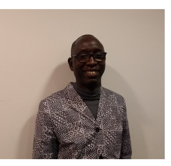
Gaoussou Gueye , President of the African Confederation of Artisanal Fisheries Organisations

for promoting the sustainable development of fisheries in our countries.