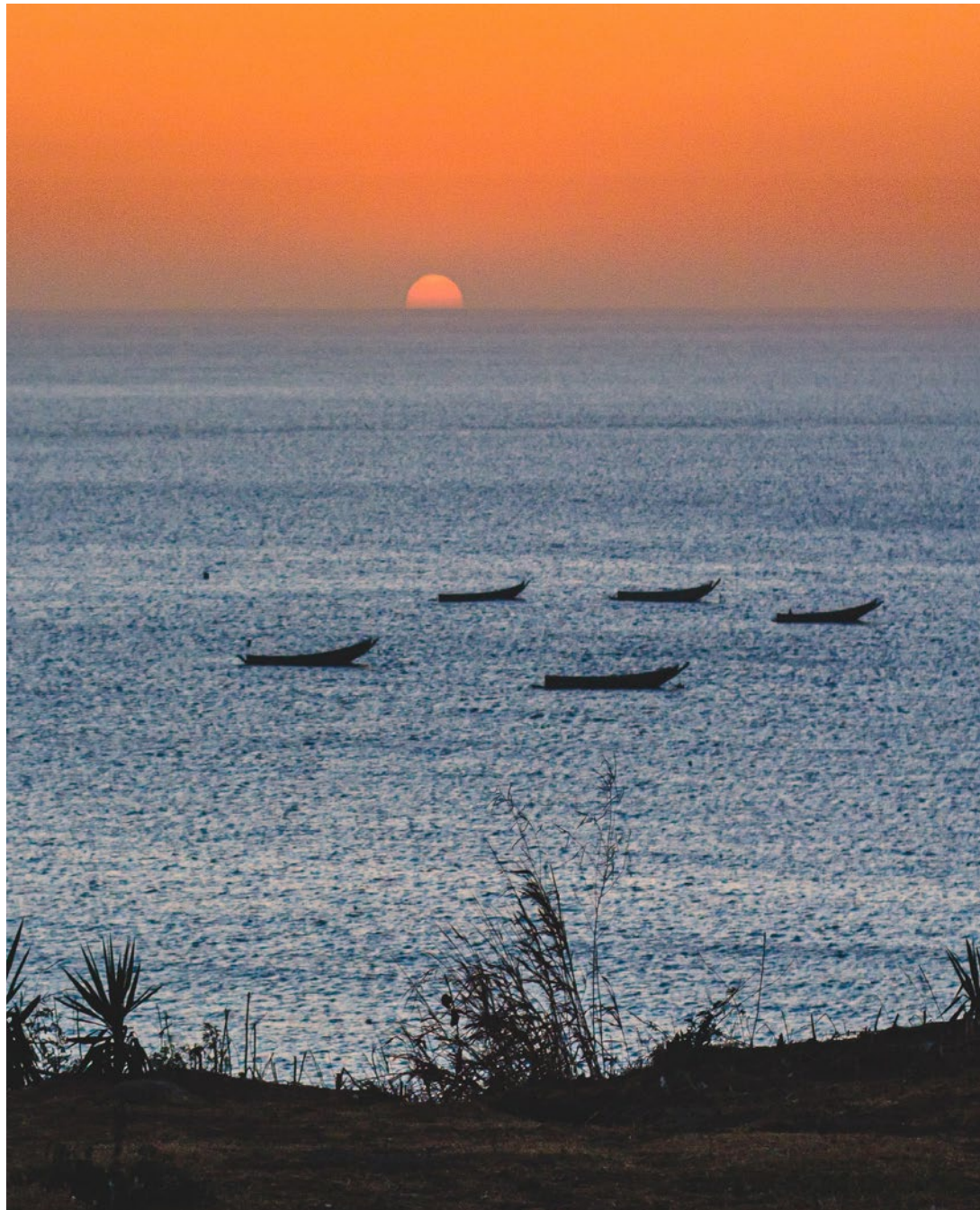
Dakar, Senegal

For instance, the coastal States should make Remote Electronic Monitoring (REM) systems (REM) compulsory, and require IMO numbers for all vessels above 12 metres in length. The additional information given by an efficient regional monitoring and surveillance system can contribute to more harmonised scientific research as well as to better understanding of interconnected marine ecosystems, cost-effective MCS and compliance at regional level.