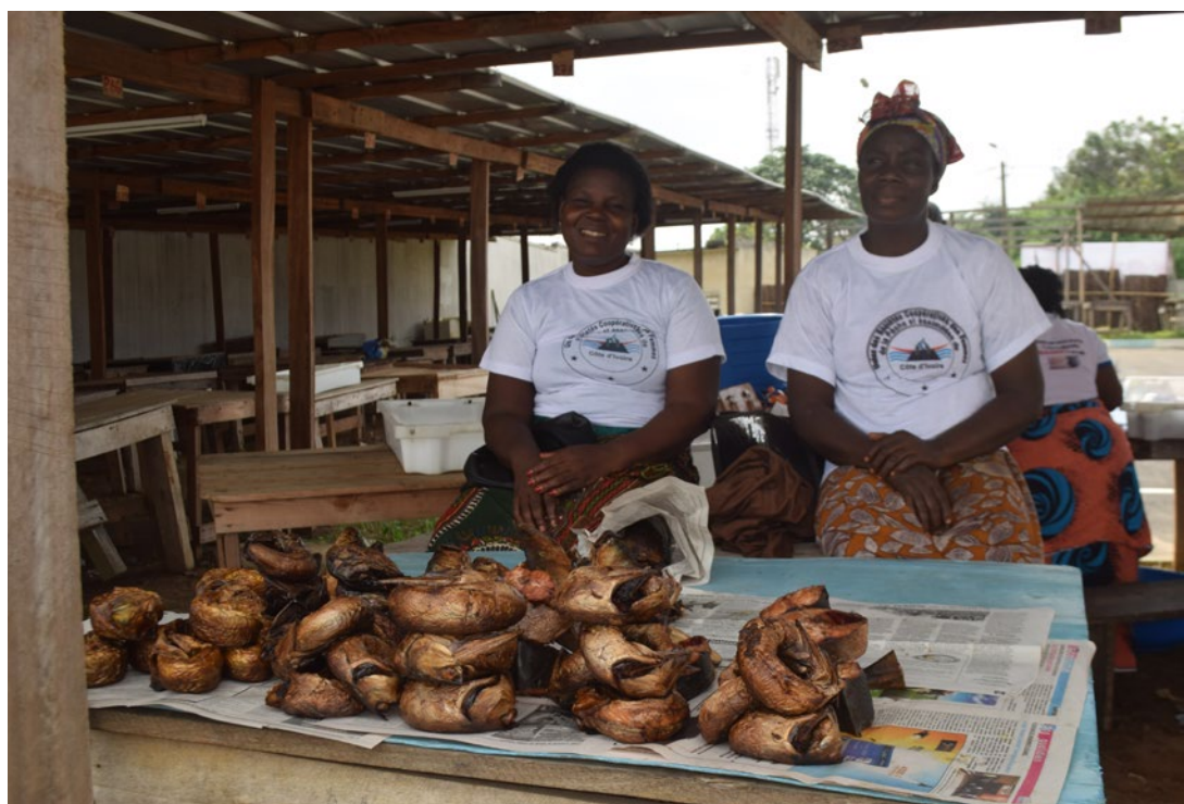
Women fish processors from the co-operative USCOFEP-Cl in Locodjro, Côte d'Ivoire

The EU and coastal States should publish annual reports on the use of sectoral support. Both parties must ensure that its use contributes to a national strategy that protects the most vulnerable populations and supports the sustainable management of marine ecosystems.