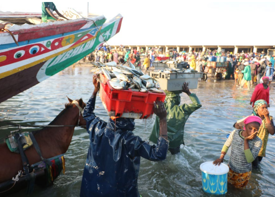
Landing site in Joal, Senegal.

The coastal States and the EU should make sure that all relevant stakeholders at local, national and regional levels are systematically and transparently consulted prior to negotiations and during the implementation period of the SFPA Protocol. This should be a strong requirement within the provisions of the Agreement itself and a condition for the EU to provide technical or financial support to the coastal State.