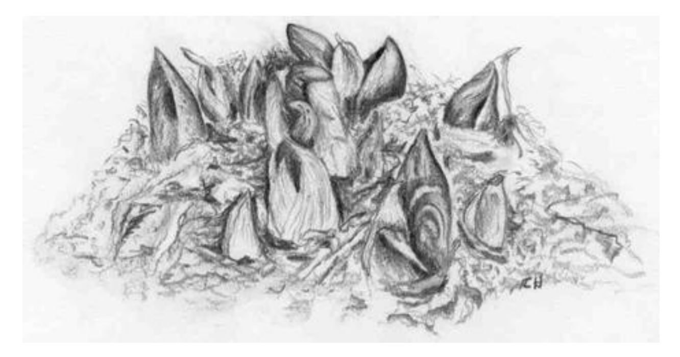
Figure 1. Group of skunk cabbages in March.

People often find it strange that I've spent parts of six years studying skunk cabbage and that I'm an unabashed admirer of this plant. After all, skunk cabbage stinks and has no beautiful blossoms. But I'm not alone. A friend of mine was driving along the northern California coast and, being attuned to skunk cabbage through my influence, she noticed a well-fashioned wooden sign on the roadside she may have overlooked otherwise: "Skunk Cabbage Discovery Trail."