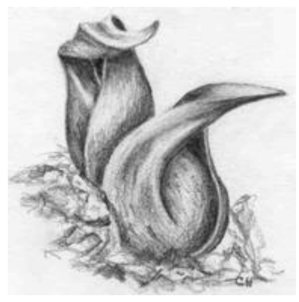
Figure 2. Skunk cabbage spathes.

Then you walk down to the edge of a meandering stream or, in my case, to a wooded wetland. Here, too, the ground is frozen, and patches of ice spread between groups of bushes and small trees (mainly red maples and alders) that dominate the wetland. In this still, quiescent world, little centers of emerging life are visible, the first sign of early spring. What I see are the four-to-six-inch-high, hood-like leaves that enclose the flowers of skunk cabbage. (See Figures 1 and 2. All drawings are by the author.)