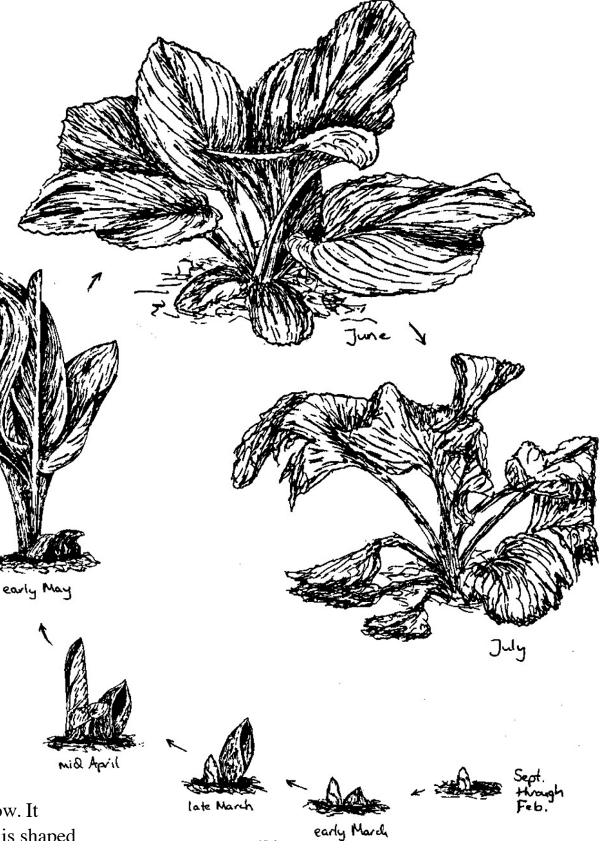
Figure 4. Skunk cabbage development.

upon itself and at the same time enwraps the next leaf. It's the closest thing to an archetypal process of unfolding you can imagine.