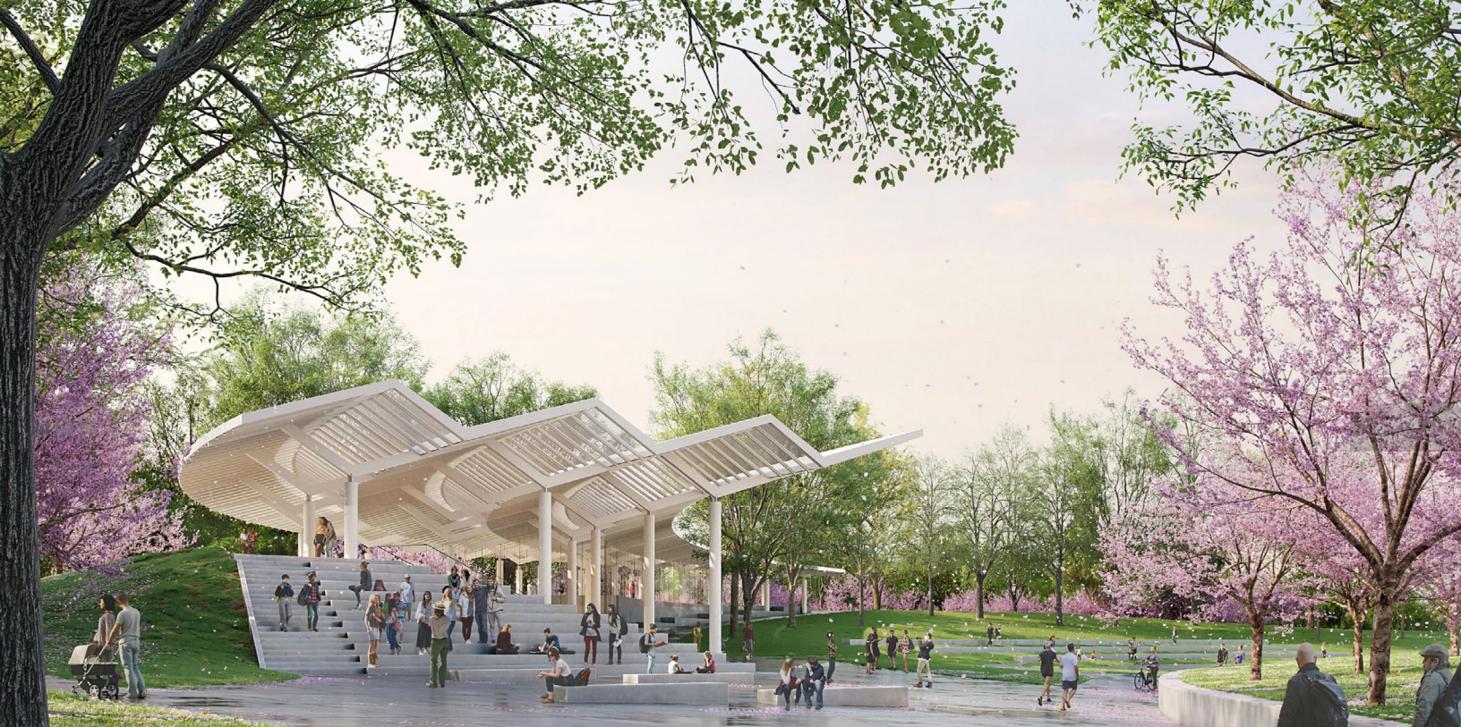
Future vision: New seating areas + plantings