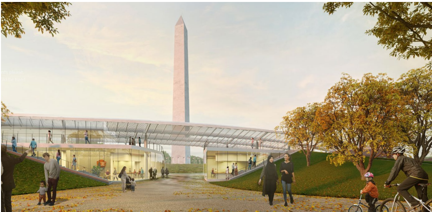
New welcome center