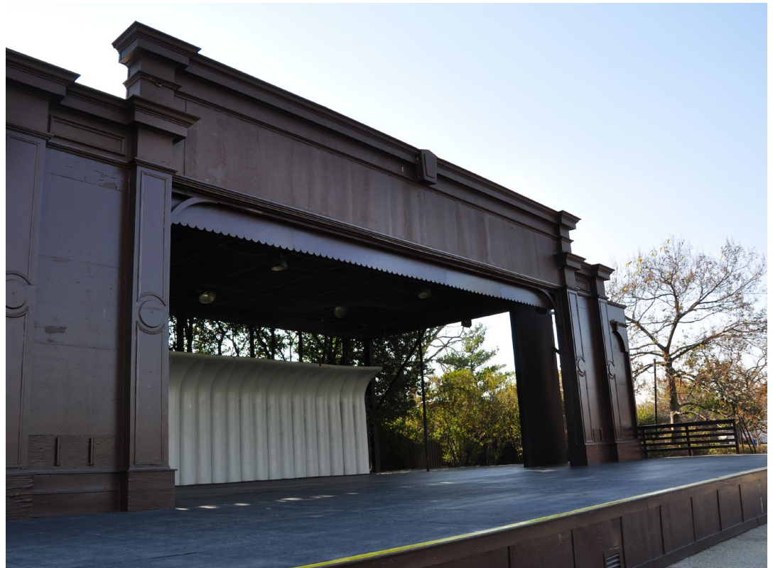
Today's Sylvan Theater lacks basic features and often sits vacant and underutilized