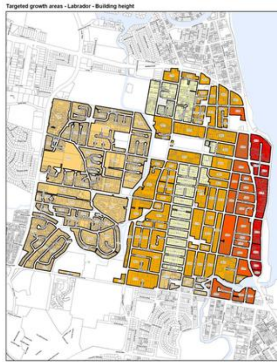
📷 Labrador has been labelled a targeted growth area in the Gold Coast City Council's City Plan, but locals fear overdevelopment will ruin the suburb's charm.

“We are not anti-development. It would be really nice to have cafes near the water, but we don’t want this suburb packed with high-rises,” she said. “Councillors are fighting to maintain the village feel of Chirn Park and Paradise Point. Why can’t that be created for Labrador with smart development, rather than packing us in like sardines to save other areas?”