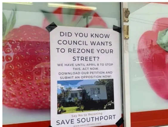
📷 One of the flyers that has been put up by the group Labrador 4215.

“There’s a lot of us trying to raise awareness, another resident set up all weekend at Chirn park and some have helped up to 15 neighbours with their submissions.”