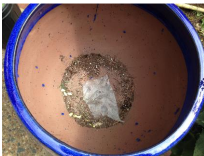
Filter fabric over three drain holes