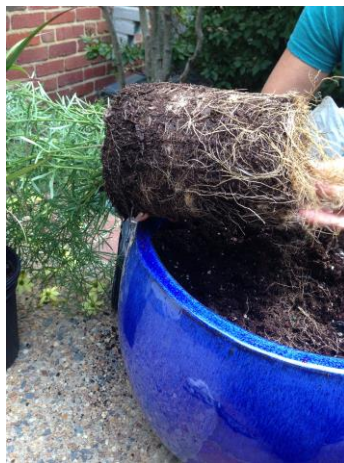
Gently loosening excess roots