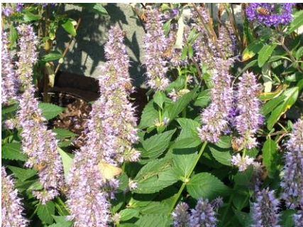
Ten bees and a Skipper forage on Agastache in a pot

The Audubon at Home program encourages you to beautify and increase the wildlife value of these small spaces. Although much of this content is directed to container gardening, patios and “pocket gardens” are merely larger extensions of the same concept, with the possible advantage of natural soils that need less additional replenishment.