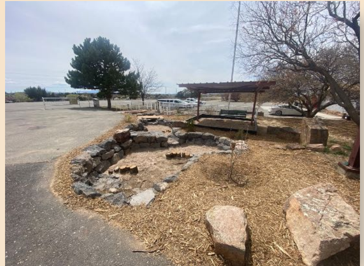
The new rain garden will provide water for the Rose Family Garden site at the Santa Fe County Extension campus on Rodeo Road.

Santa Fe County's Sustainability Division hosted an Earth Day celebration at the County Fairgrounds on April 22. Although the main event of the day was the planting of Santa Fe County's newest rain garden, there were plenty of activities and music for all attendees.