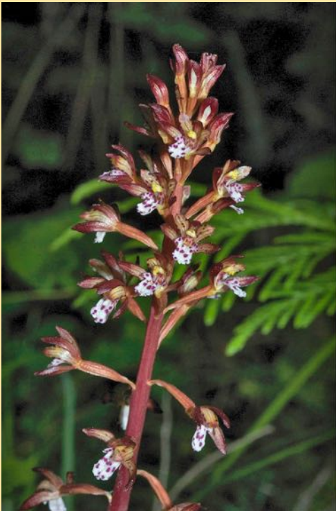
Spotted Coralroot ( Corallorhiza maculata ) Courtesy Terry Glaze,