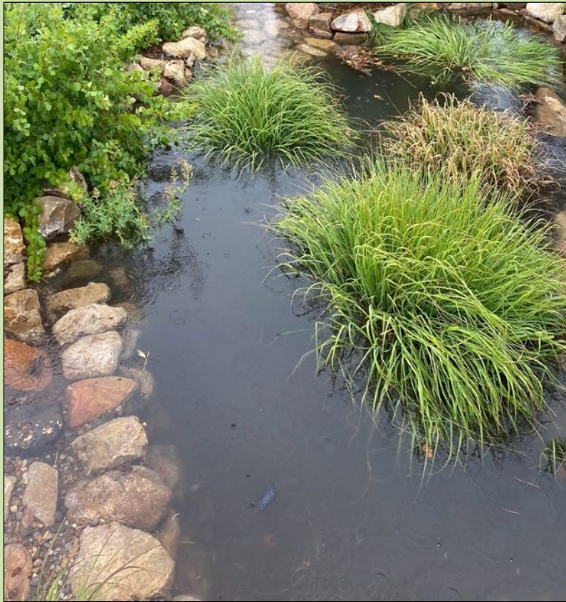
A Santa Fe rain garden after the rain