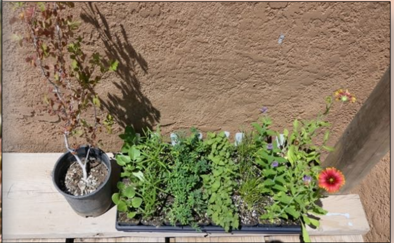
Top: Low-to-medium water kit Left: native bee on Apache Plume ( Fallugia paradoxa ), the shrub species in this year's low-water kits