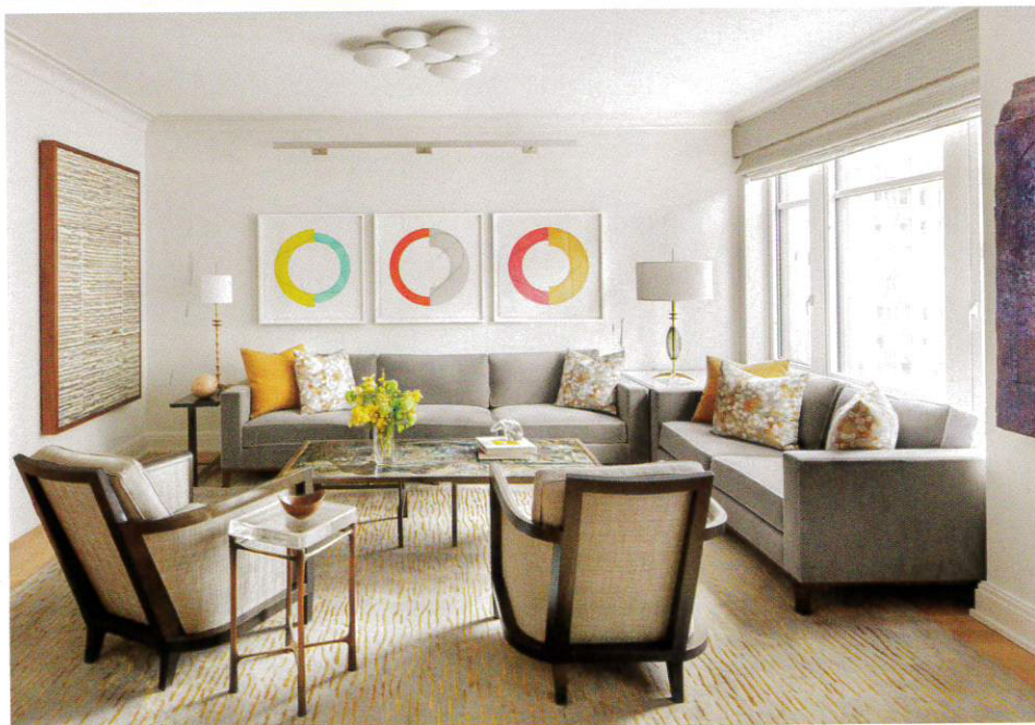
THIS PAGE: JILL LEWIS. AJS DESIGNS. ORLANDO COMAS. OPPOSITE: CAROL KURTH. ALLED.

For New York City clients with a burgeoning contemporary art collection and a new apartment, a subtle backdrop is the best way to showcase their treasures. Neutral walls topped by a Greek Revival-style cornice balance wood flooring, while flat-panel shades adorn windows. Contemporary furniture and light fixtures also defer to the art on display.