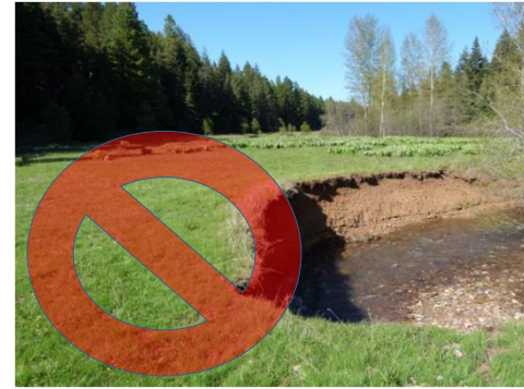
Photo at upper right is an example of an unhealthy riparian area , lacking in vegetation, cover or instream habitat complexity.

Below is an example of a healthy, functional, diverse riparian area .