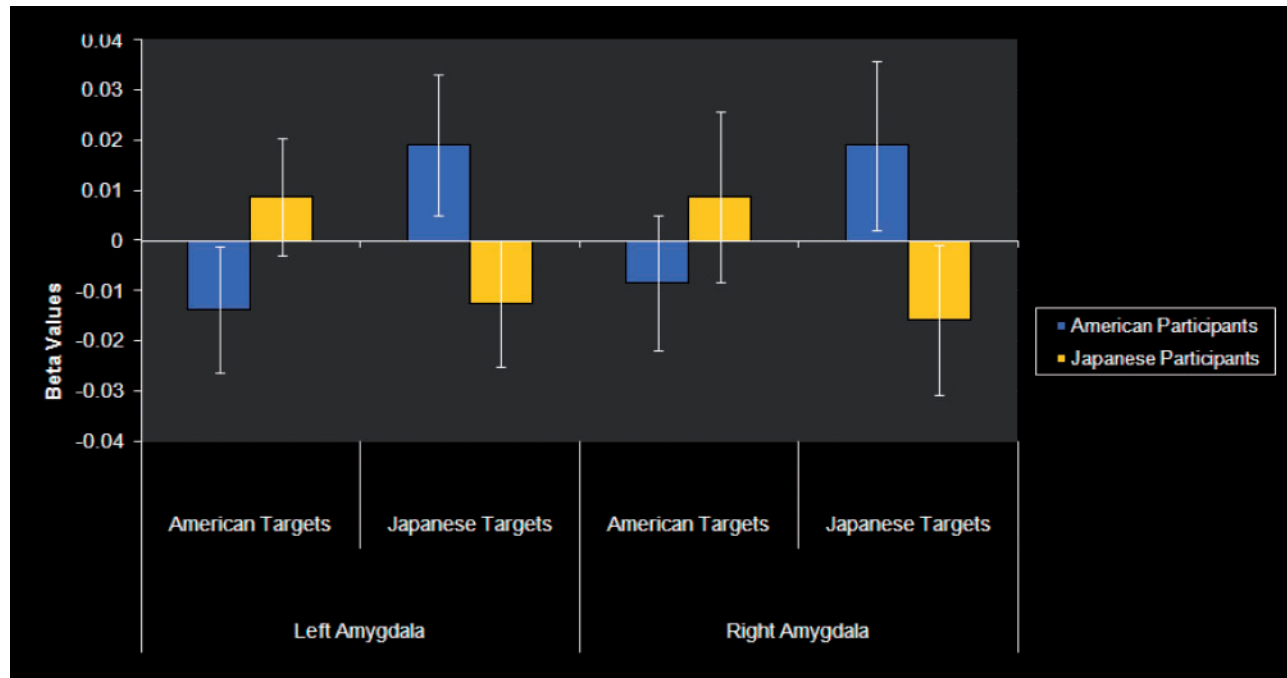
Fig. 2 Mean beta values showing the participant culture by target culture interaction, plotted separately for the left and right amygdalae. Participants showed a greater response to opposite-culture, outgroup targets.

significant clusters of activation for voted over not-voted targets in the right (Talairach Coordinates: 22, -2, -23; 192 mm 3 ) and left (Talairach Coordinates: -22, -6, -20; 275 mm 3 ) amygdalae, as well as in the left superior temporal gyrus (Talairach Coordinates: -41, 2, -15; BA 38; 449 mm 3 ) and right inferior frontal gyrus (Talairach Coordinates: -29, 10, -15; BA 47; 409 mm 3 ). The target culture × participant culture interaction showed two clusters of significant activation: one in the left superior frontal gyrus (Talairach Coordinates: -19, 39, 36; BA 9; 175 mm 3 ) and a second in the left culmen of the cerebellum (Talairach Coordinates: -9, -34, -17; 293 mm 3 ). Mean extracted beta values from these clusters showed an outgroup effect, similar to what we observed in the amygdala ROI analyses above. Specifically, Japanese participants showed a greater response to outgroup, American targets and American participants showed a greater response to outgroup, Japanese targets in both the cerebellar culmen and the superior frontal gyrus.