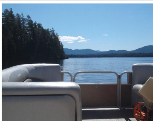
Ready for campers

College Counselor, MESA Charter High School, Brooklyn, NY