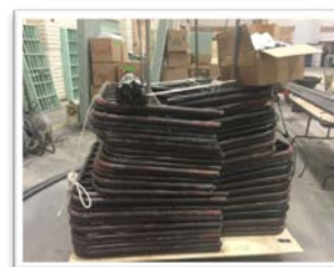
painted to look 'vintage'