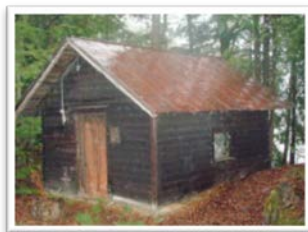
Pump House -built 1903

The dishwasher needs to be replaced, there will be reconfiguration of counters and sinks, and the ventilation system will be updated. All of this work is intended to provide a more sanitary kitchen that conforms to DOH regulations for commercial kitchens, a key to reopening camp. Much of this work is envisioned to be completed by volunteers especially the prep and painting.