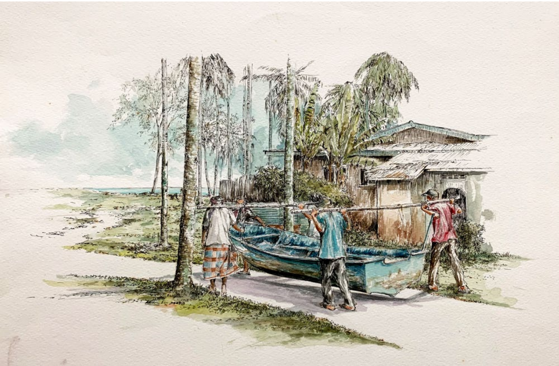
Men Carrying Boat, Merang, Terengganu Ink & Watercolor on paper | 2009 14.5 x 10.5 inches

This painting comes with PINKGUY signature conservation framing