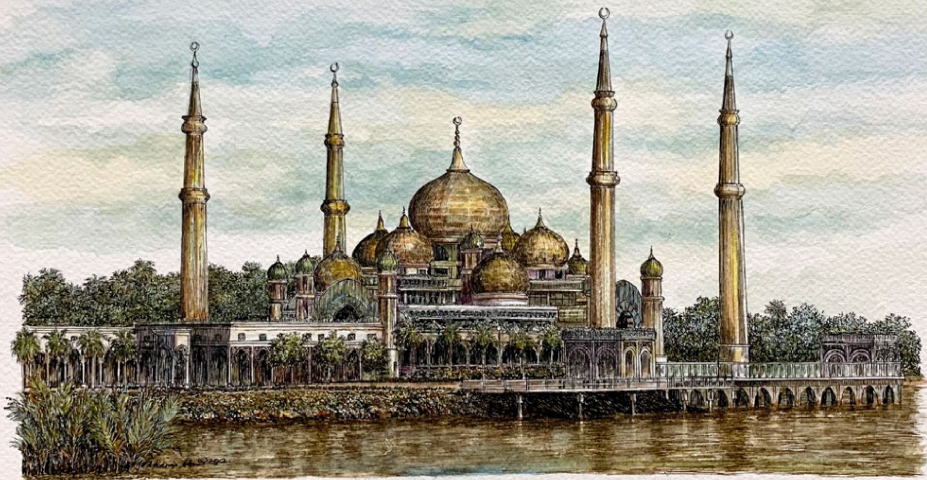
Crystal Mosque, Taman Budaya, Kuala Terengganu Ink & Watercolor on paper | 2012 14.5 x 9.5 inches

This painting comes with PINKGUY signature conservation framing