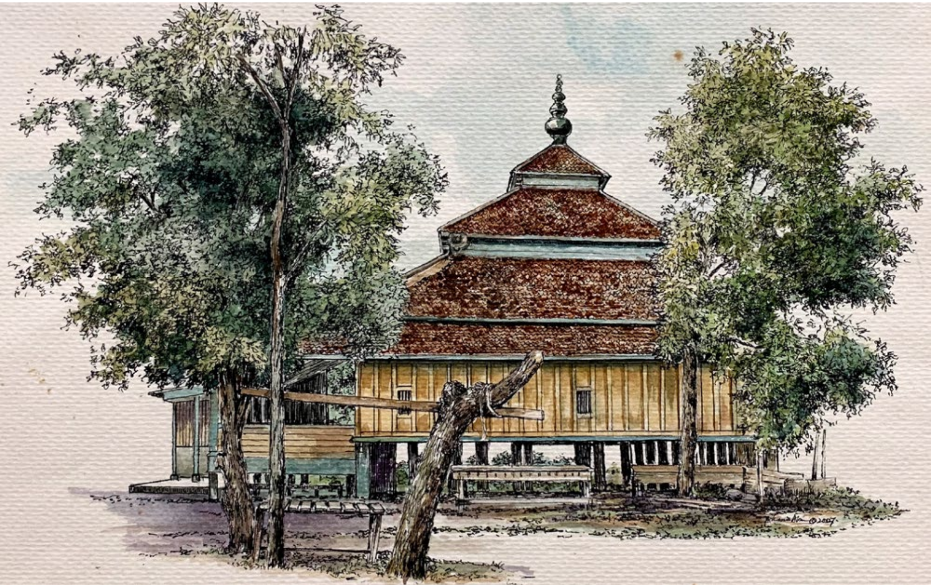
Old Surau, Dungun, Terengganu