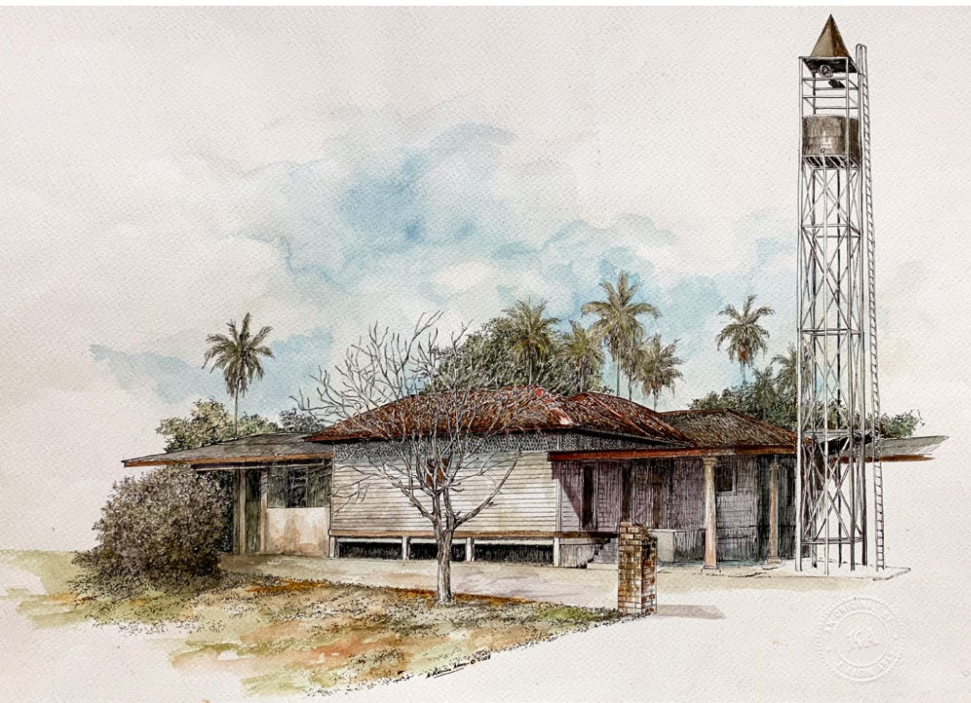
Surau Tengku Long, Kg. Raja, Besut, Terengganu Ink & Watercolor on paper | 2008 17.5 x 11.5 inches

This painting comes with PINKGUY signature conservation framing