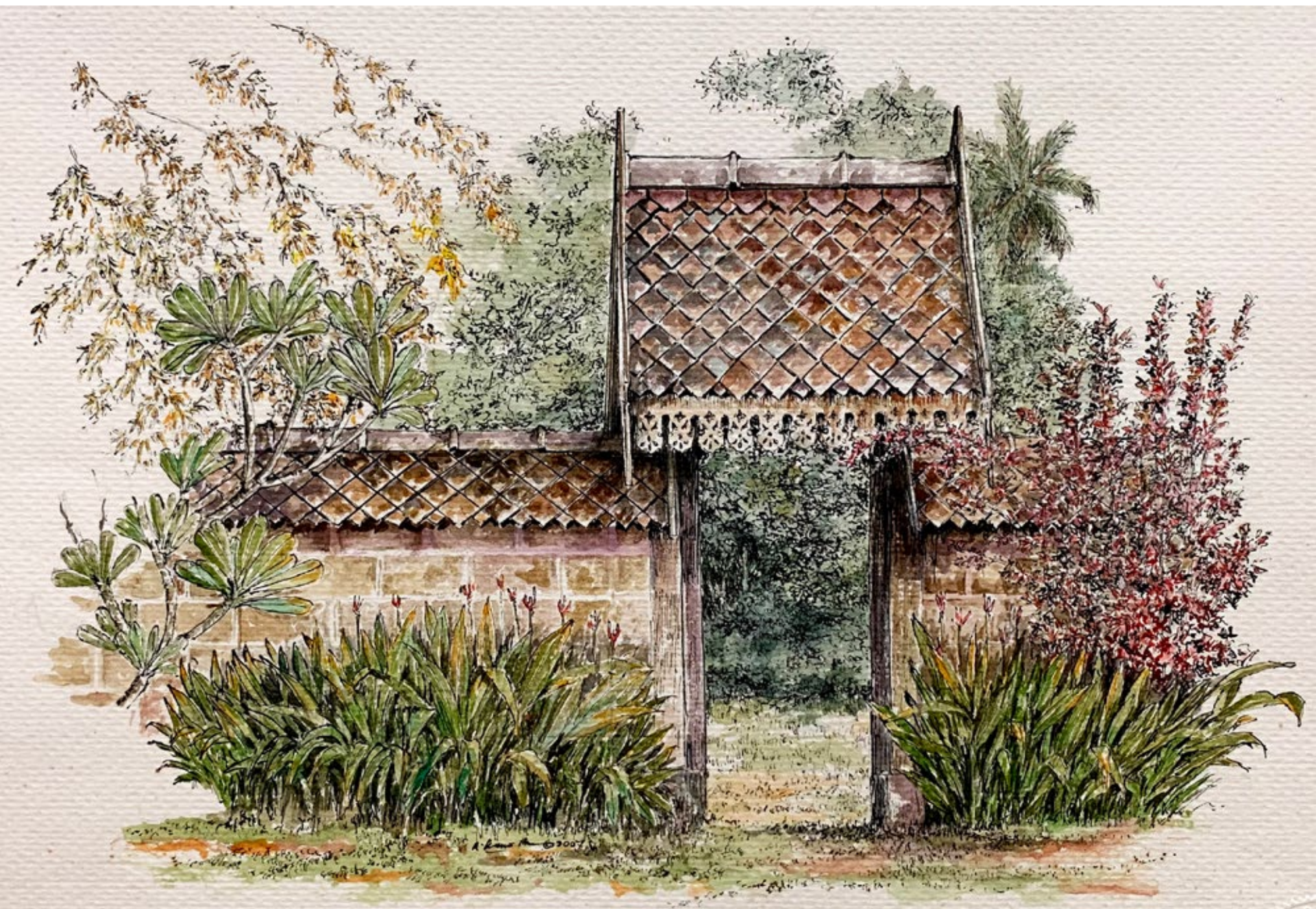
Smaller Gate, Tanjung Sabtu, K.Terengganu