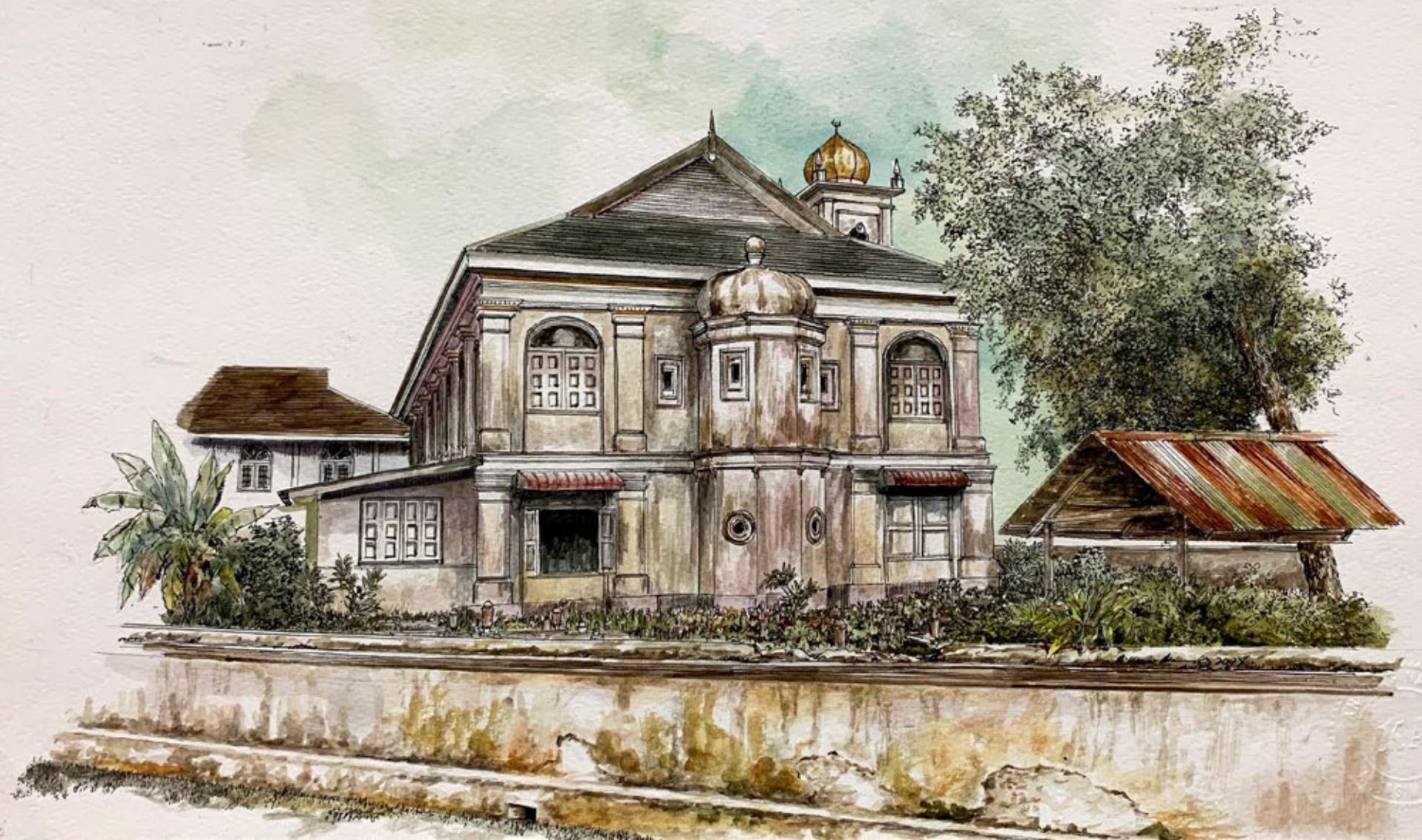
Hiliran Mosque, Kuala Terengganu