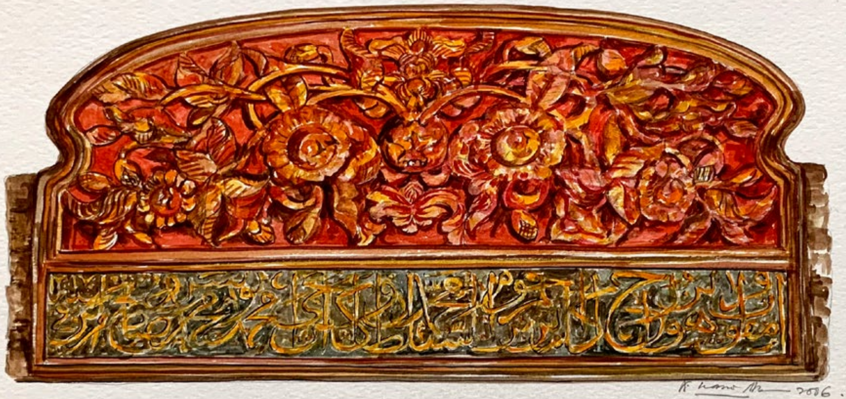
Decorative Koran Scripted Panel of Fishing Boat Watercolor on paper | 2006 10.5 x 6.5 inches

This painting comes with PINKGUY signature conservation framing