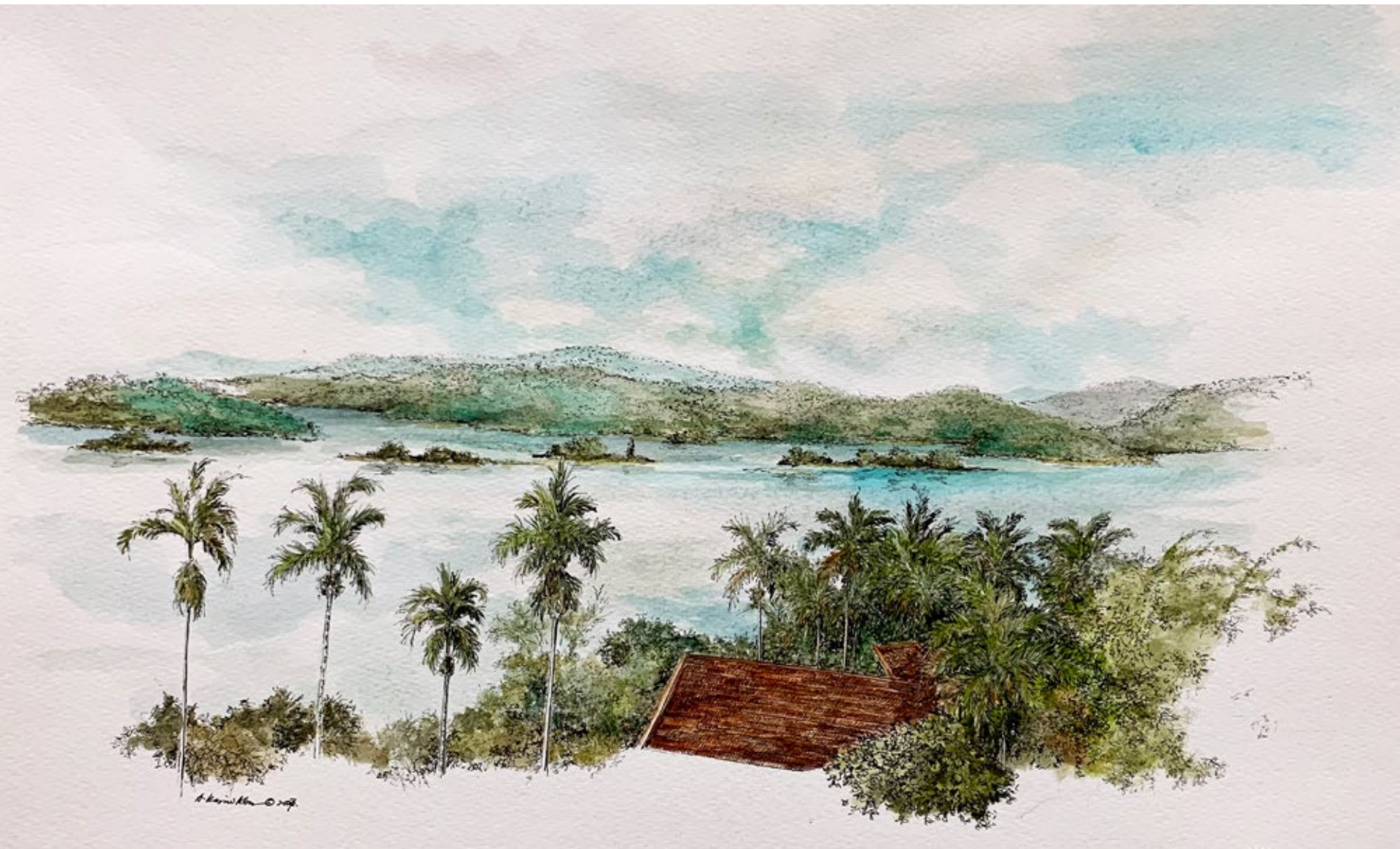
View of Tasek Keyir From Resort Ink & watercolor on paper | 2007 15.5 x 9.5 inches

This painting comes with PINKGUY signature conservation framing