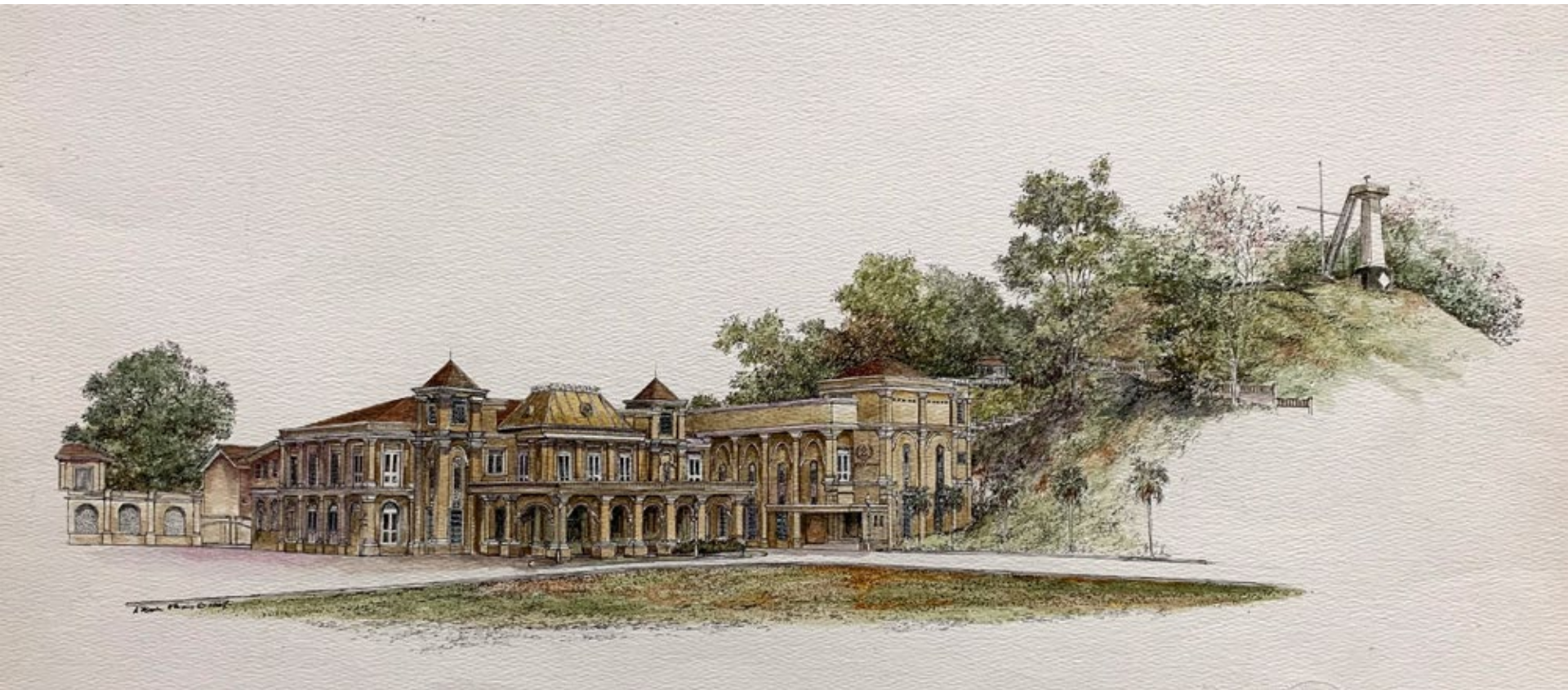
Istana Maziah K. Terengganu Ink & Watercolor on paper | 2007 25.5 x 12.5 inches

This painting comes with PINKGUY signature conservation framing