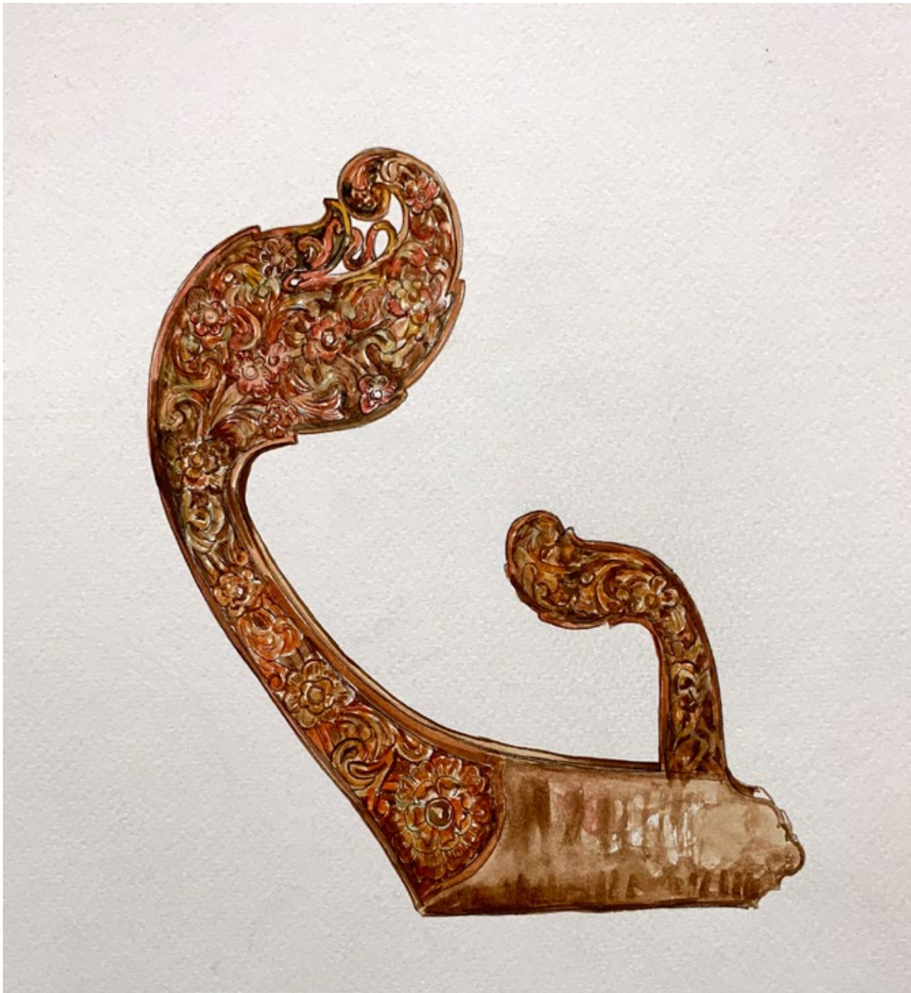
Painted Carved Wooden Bangau of Fishing Boat Watercolor on paper | 2006 10.5 x 9.5 inches

This painting comes with PINKGUY signature conservation framing