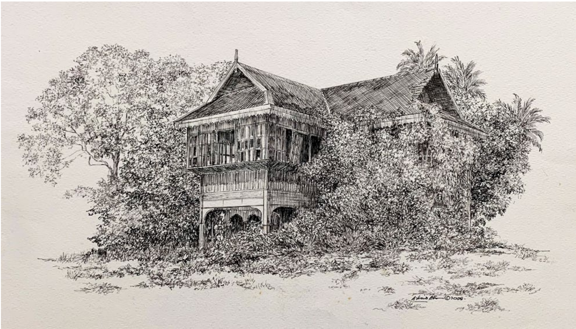
Old Abandoned Istana, Kampong Raja, Besut, Terengganu Ink on paper | 2008 15.5 x 9.5 inches

This painting comes with PINKGUY signature conservation framing