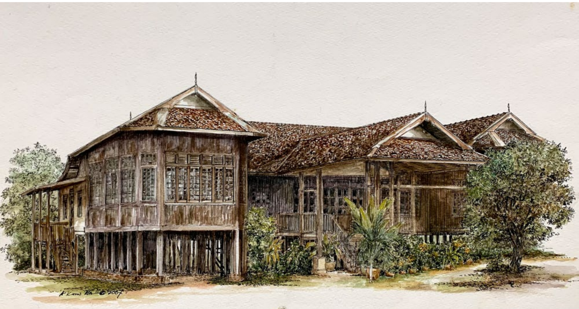
Rumah Orang Kaya 1, Losong, Kuala Terengganu Ink & Watercolor on paper | 2007 15.5 x 7 inches

This painting comes with PINKGUY signature conservation framing