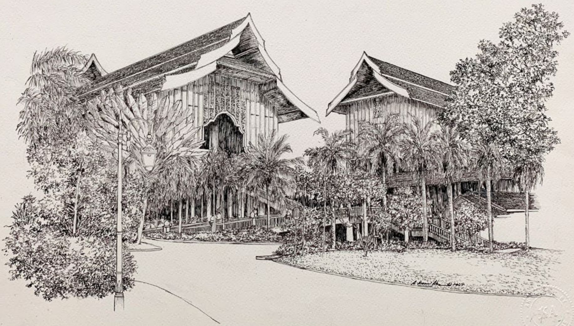
Museum Complex, Losong, Kuala Terengganu