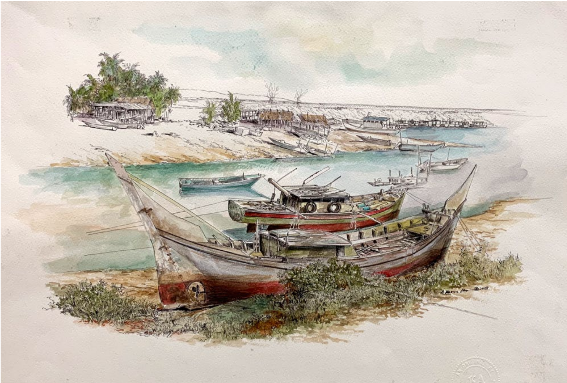
Old Boat, Marang, Terengganu Ink & Watercolor on paper | 2008 17.5 x 11.5 inches

This painting comes with PINKGUY signature conservation framing