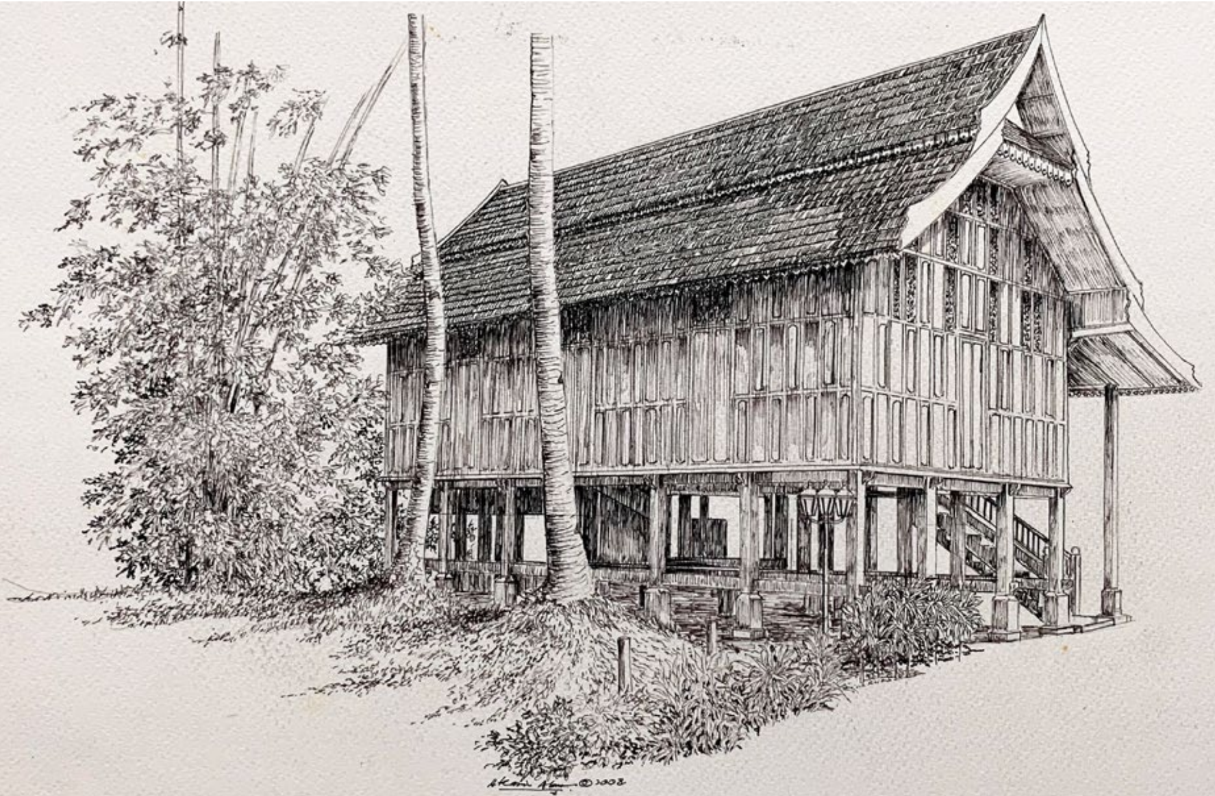
Rumah Tele, Museum Terengganu Complex, Losong Ink on paper | 2008 17.5 x 11.5 inches

This painting comes with PINKGUY signature conservation framing