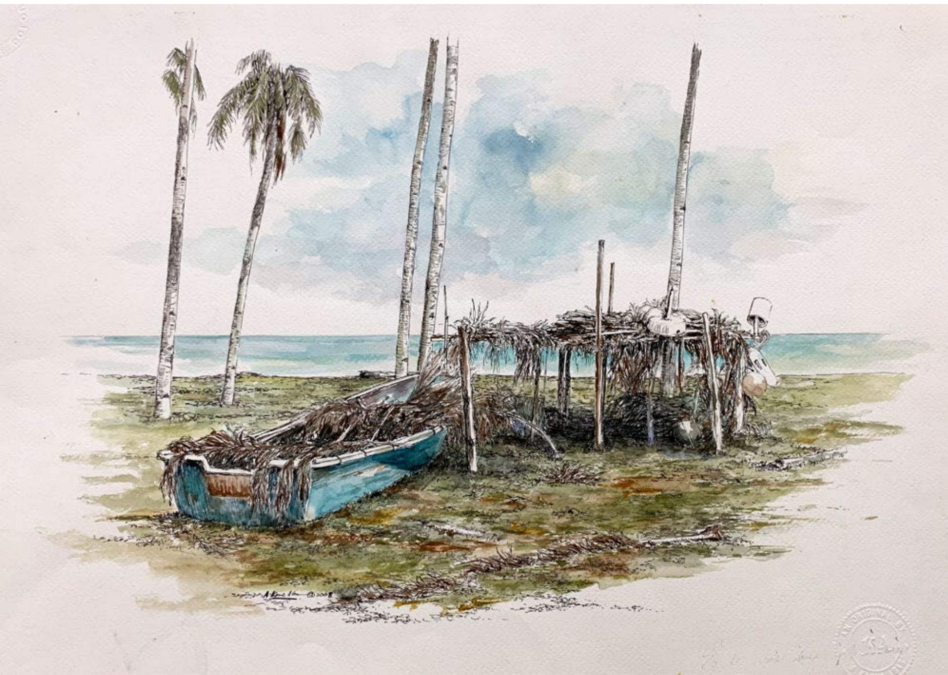
Boat under shed, Penarik, K. Terengganu