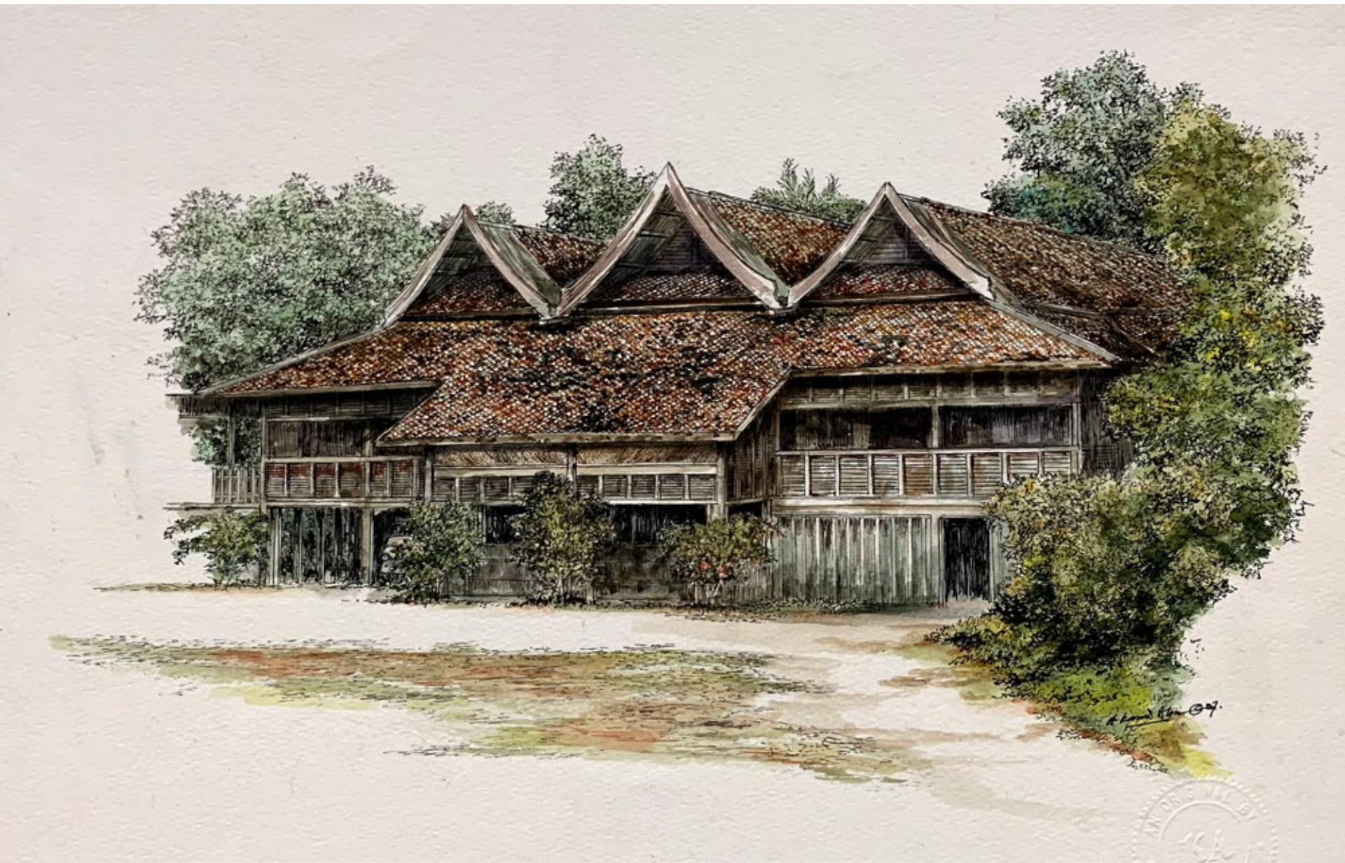
Rumah Orang Kaya 2, Losong, Kuala Terengganu Ink & Watercolor on paper | 2007 14.5 x 10 inches

This painting comes with PINKGUY signature conservation framing