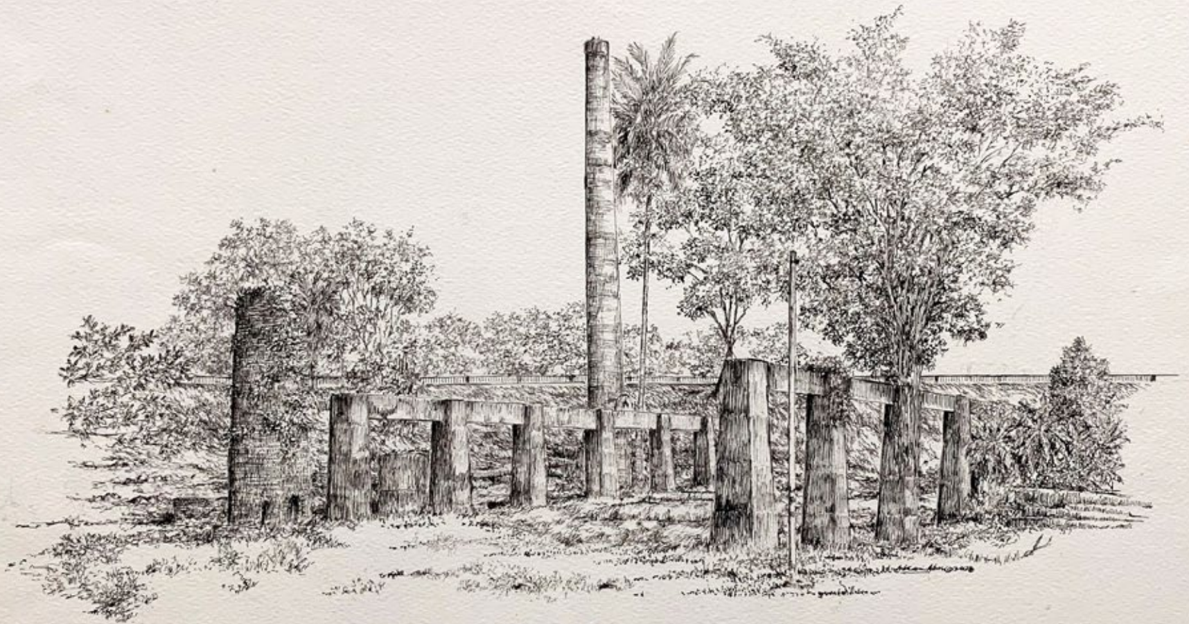
Abandoned Railway Track and Furnace, Bukit Besi, Terengganu Ink on paper | 2008 17.5 x 11.5 inches

This painting comes with PINKGUY signature conservation framing