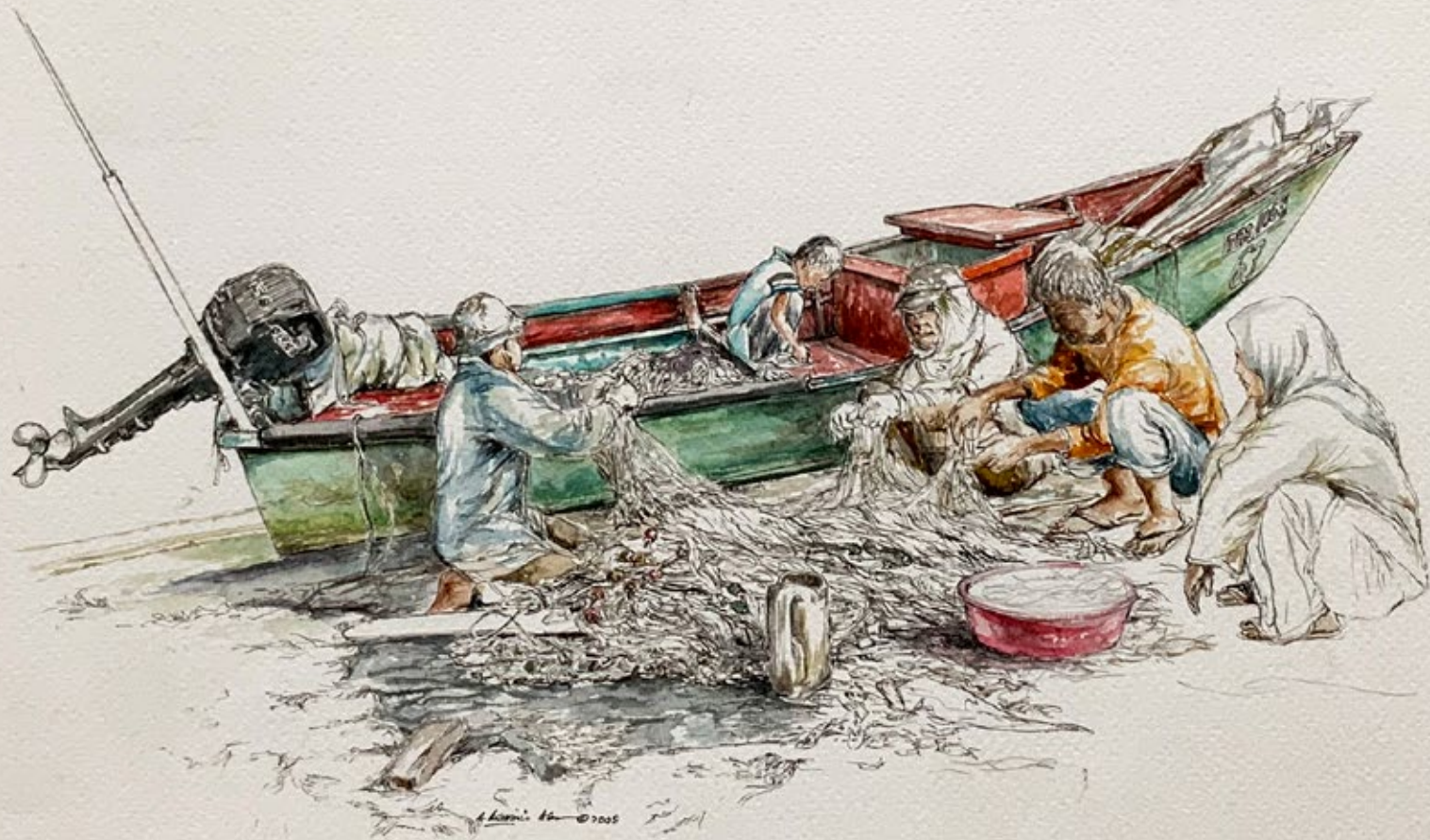
Sorting The Days Catch on The Beach Ink & watercolor on paper | 2008 14.5 x 9.5 inches

This painting comes with PINKGUY signature conservation framing