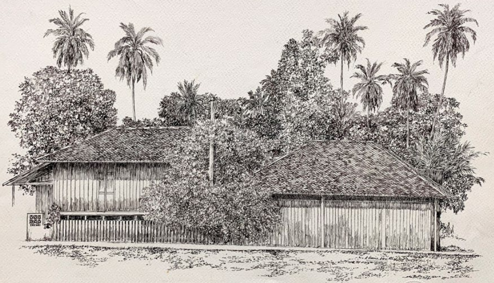
Rumah 2, Kampong Raja, Besut, Terengganu