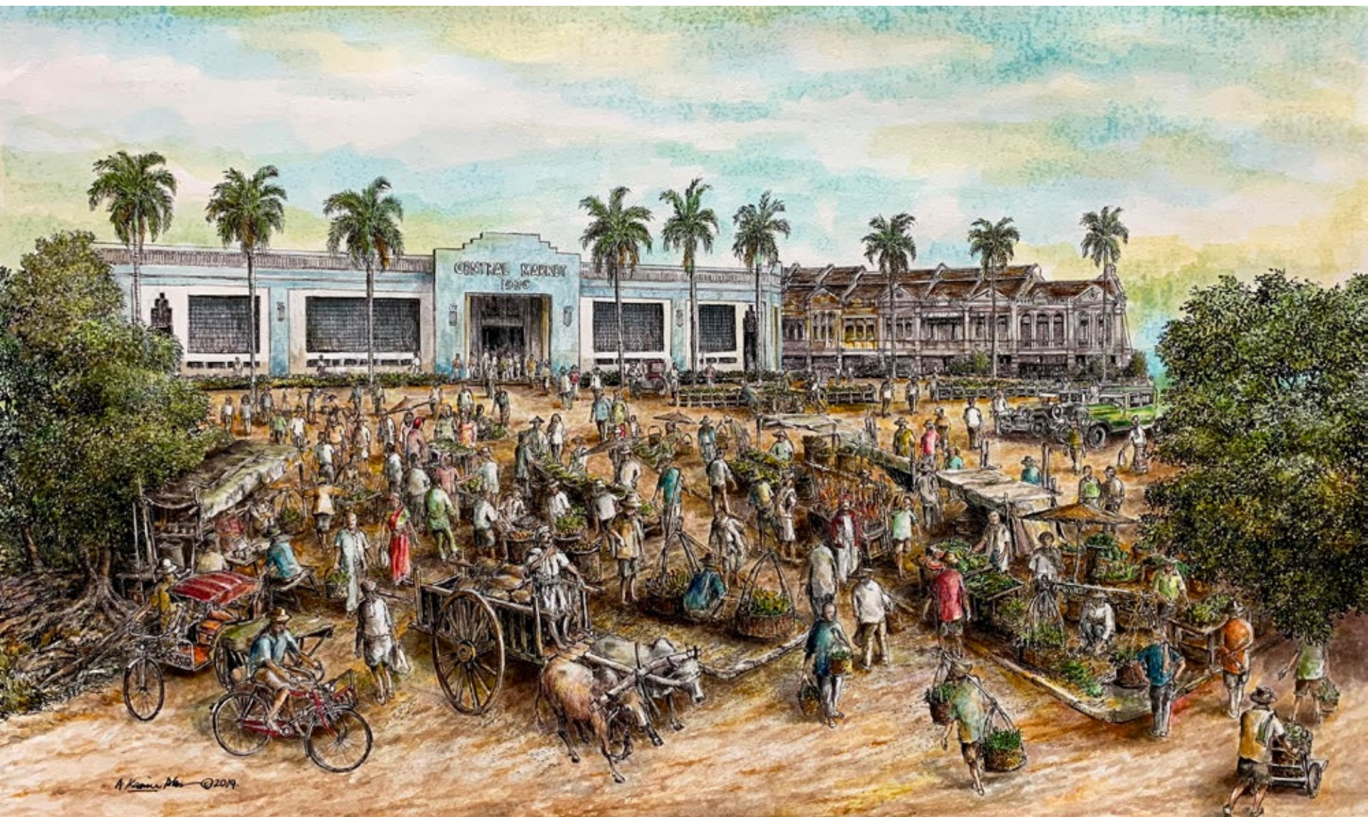
Central Market KL 1936 Ink & Watercolor on paper | 2019 21.5 x 12.5 inches

This painting comes with PINKGUY signature conservation framing