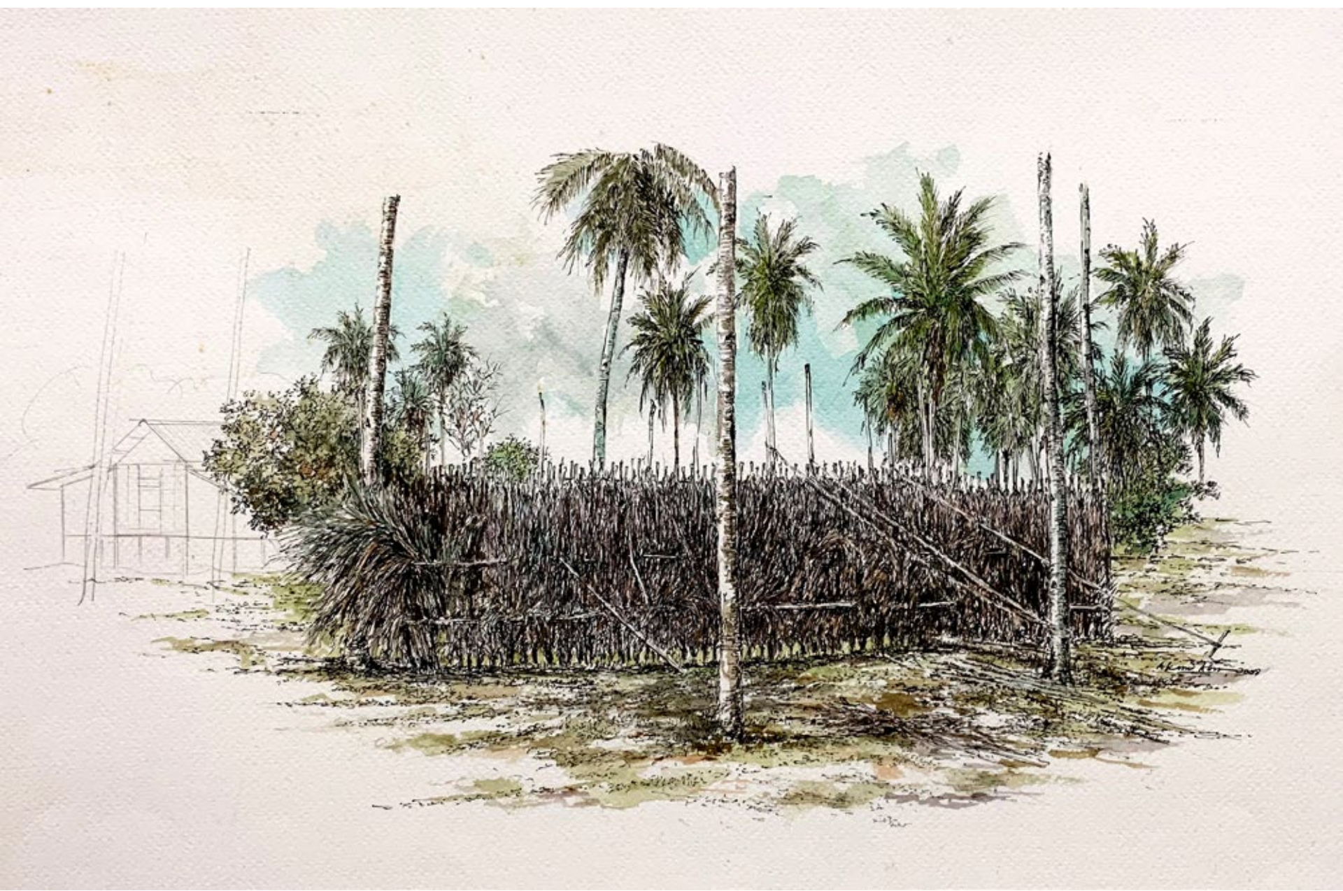
Wind and Wave Sprays Breaker, Kijal, Terengganu Ink & Watercolor on paper | 2008 17.5 x 11.5 inches

This painting comes with PINKGUY signature conservation framing