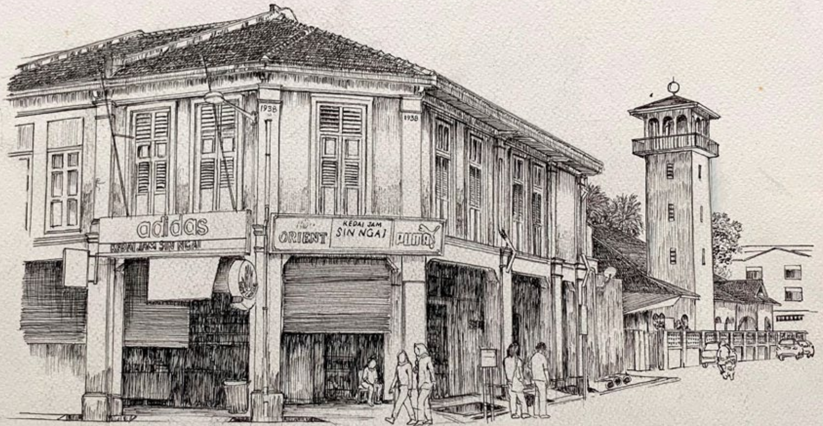
Old Mosque and shop houses, Kemaman, Terengganu