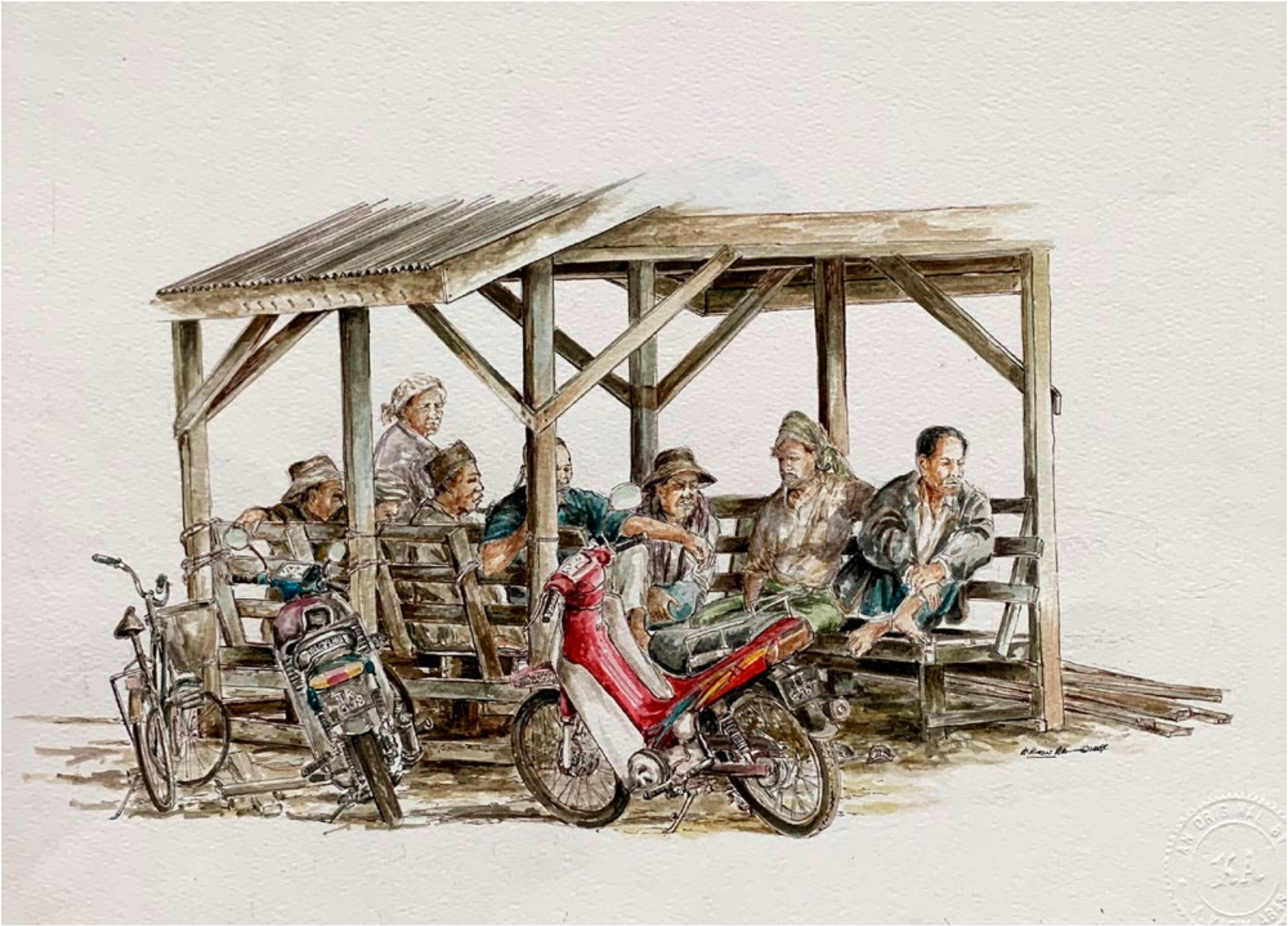
Let's Chill, Sea is Too Rough To Go Fishing Ink & Watercolor on paper | 2007 14.5 x 10.5 inches

This painting comes with PINKGUY signature conservation framing