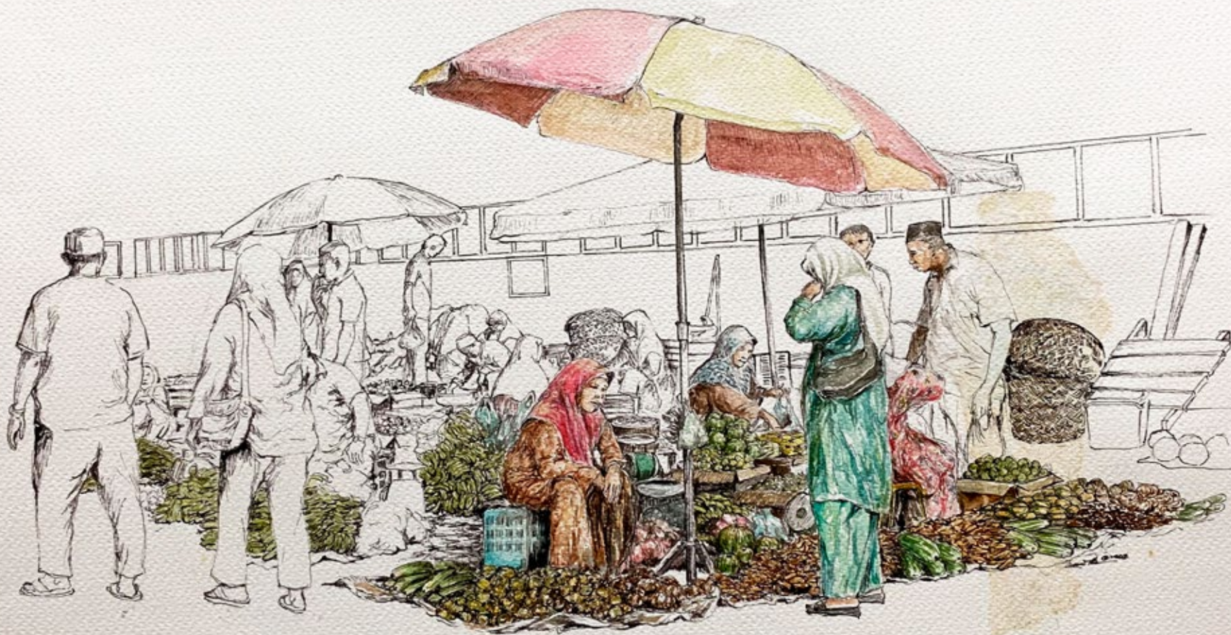
Pasar Basah, Dungun, Terengganu Ink & watercolor on paper | 2008 17.5 x 11.5 inches

This painting comes with PINKGUY signature conservation framing