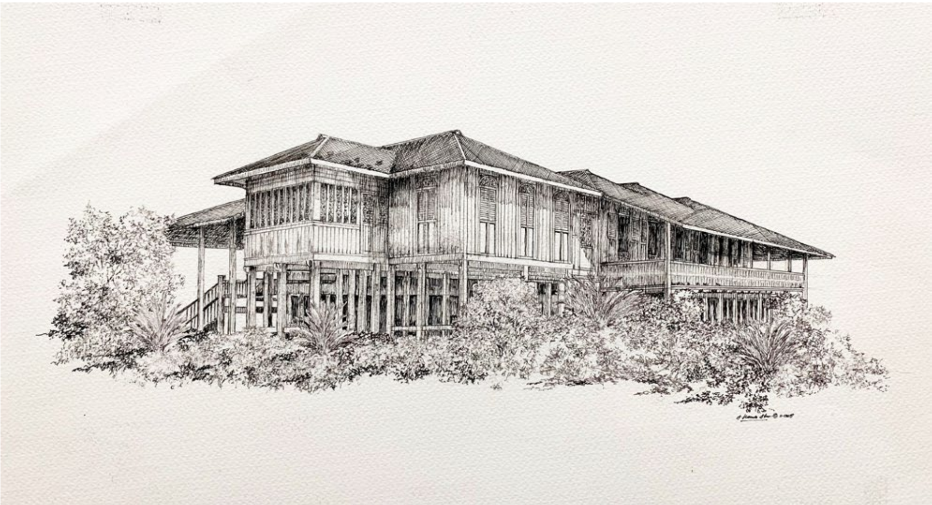
Rumah Tengku Long, Musuem Complex, Losong, Kuala Terengganu Ink on paper | 2008 17.5 x 11.5 inches

This painting comes with PINKGUY signature conservation framing