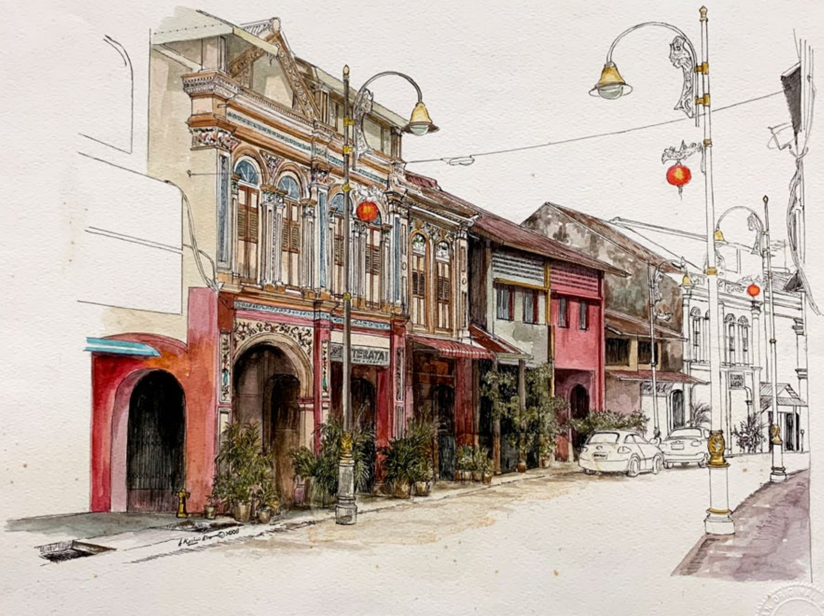
Pekan Cina, Kuala Terengganu Ink & watercolor on paper | 2008 17.5 x 11.5 inches

This painting comes with PINKGUY signature conservation framing