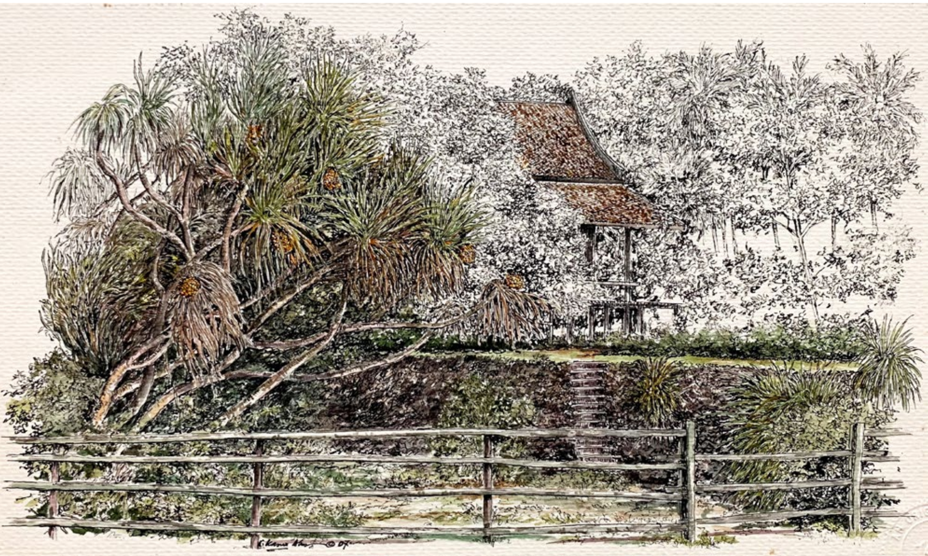
Terengganu House, Merang, Terengganu Ink & Watercolor on paper | 2007 8 x 13.5 inches

This painting comes with PINKGUY signature conservation framing