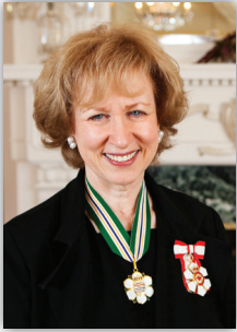
Rt. Hon. Kim Campbell

The Right Honourable Kim Campbell PC CC OBC QC, currently the founding principal of the Peter Lougheed Leadership College at the University of Alberta, has led an exemplary public life, having served as a School Board Trustee and Chair, an MLA for Vancouver-Point Grey and as MP for Vancouver Centre.