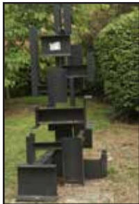
1975, Welded steel Eastern Middle School