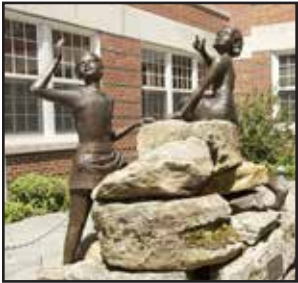
1994, Bronze Cos Cob School

Commissioned by the Greenwich Board of Education.