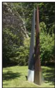
5 Barbara Zucker Two Triangles

1984, Stainless & Cor-Ten steel Greenwich Library