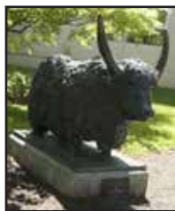
6 Shay Rieger Yak