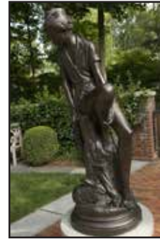
1928, recast and installed 2000 Perrot Memorial Library