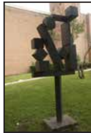
1992, Welded steel Eastern Middle School