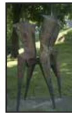
10 Lynn Chadwick Dancing Figures

1956, cast 2/4 in 2000, Bronze Bruce Museum of Arts and Science