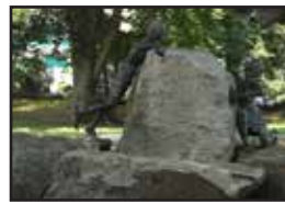
7 Douglas More Tag Around Rocks

1991, Bronze Greenwich Common, Greenwich Avenue