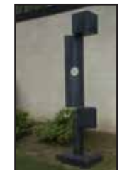
18 Paul Eahan Untitled