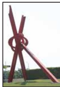
8 Mark diSuvero Borealls

Commissioned by the Town under the sponsorship of Greenwich Green & Clean.