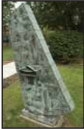
1980, Soldered copper Eastern Middle School

Commissioned by Eastern Middle School Parent Teacher Association.