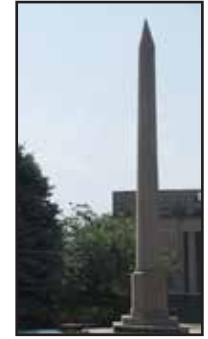
1927, Granite Greenwich Avenue

This obelisk honors the men and women of Greenwich who served in World War I. Dedicated on Armistice Day, November 11, 1927.