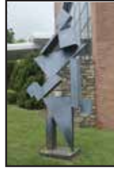
1992, Welded steel Eastern Middle School