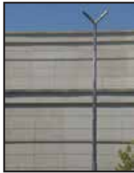
4 George Rickey Two Lines Up Oblique

Copyright George Rickey all rights reserved 1977-98 Stainless steel Greenwich Library