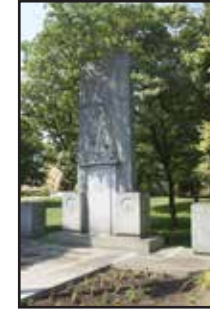
1956, Granite Greenwich Avenue near Arch Street

Sponsored by Greenwich veteran's organizations, "In Reverent Memory of Those from the Town of Greenwich Who Made the Supreme Sacrifice-World War II, Korea, Vietnam."