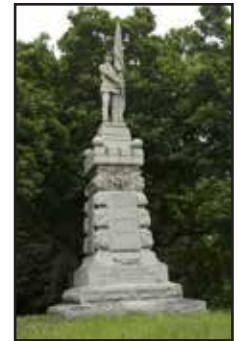
1890, Granite Post Road and Maple Avenue

Erected by the Town in memory of her "loyal sons who fought for the Union, 1861-1865." Engraved on the sides are Civil War battles, including New Berne, the first battle in which Greenwich troops were engaged.