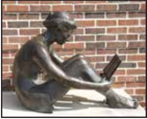
1999, Bronze Cos Cob Library