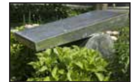
17 Norman Mansson Untitled

1975, Stainless steel Milbank Avenue rotary