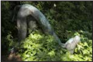
1952, Cast bronze Montgomery Pinetum