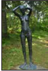
1971, Bronze Montgomery Pinetum