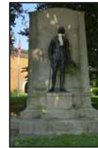
1922, Bronze statue, granite base Greenwich Avenue & Arch Street