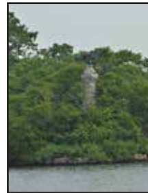
c. 1900. Bronze Greenwich Point