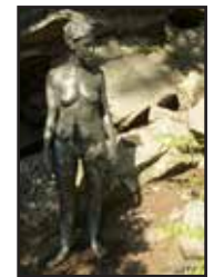
16 George Segal Girl Standing in Nature

Commissioned by the Town of Greenwich Millennium Committee.