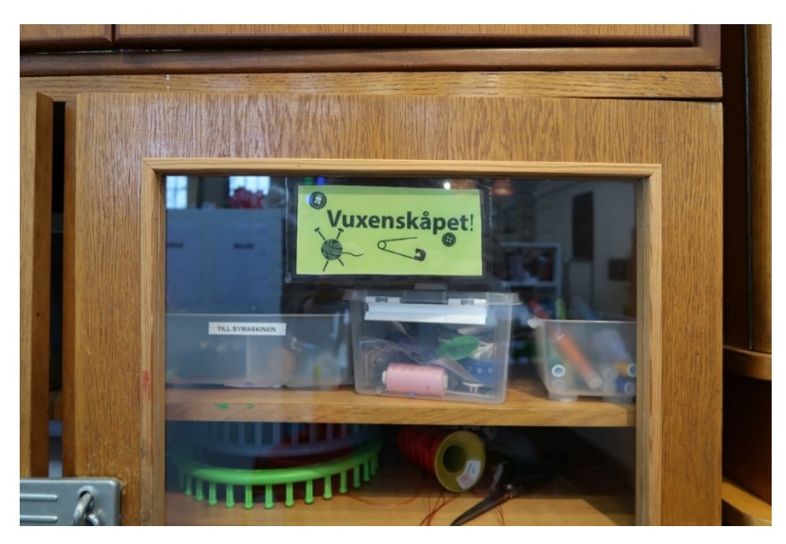
Figure 12. Accessories for sewing at Garaget in Malmö