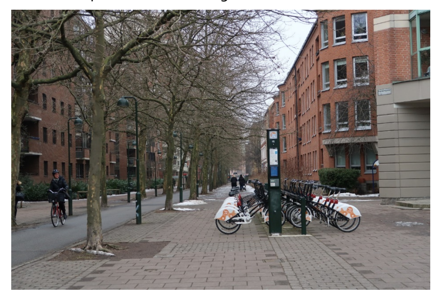
Figure 13. Municipal bike sharing scheme Malmö by Bike

Municipal bike sharing helps deliver health and environmental benefits by promoting active travel by bike instead of using a car (Fig. 13). In particular, it targets short trips with the hope of reducing overall traffic and the use of parking space. The initiatives contribute to the environmental sustainability agenda in the city, and could improve the well-being and health of Malmö citizens.