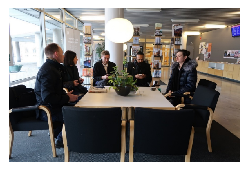
Figure 6. Mobile lab team at Malmö City Hall (Stadshuset)

different kinds of bikes, including cargo and family bikes. This solution has allowed the developers to avoid building extra car parks – a trend that is becoming increasingly popular in Malmö.