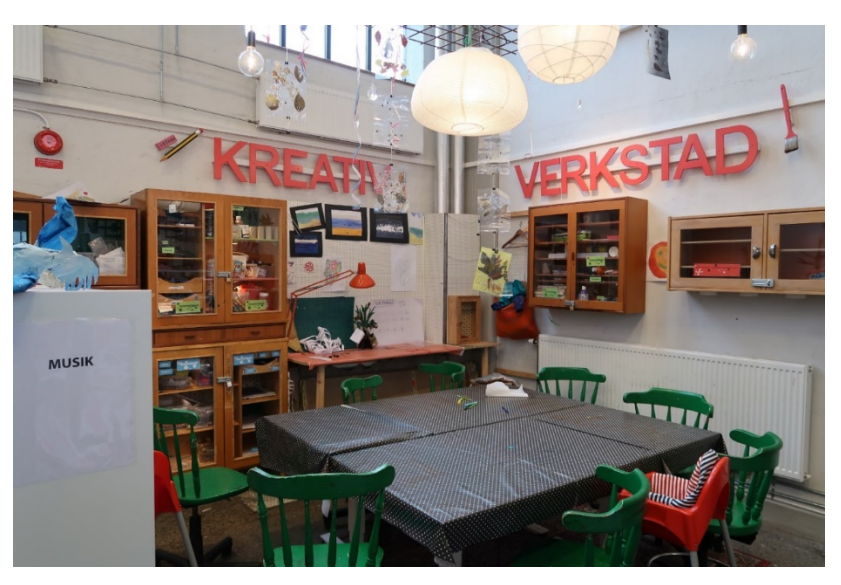
Figure 14. Creative workshop at Garaget library