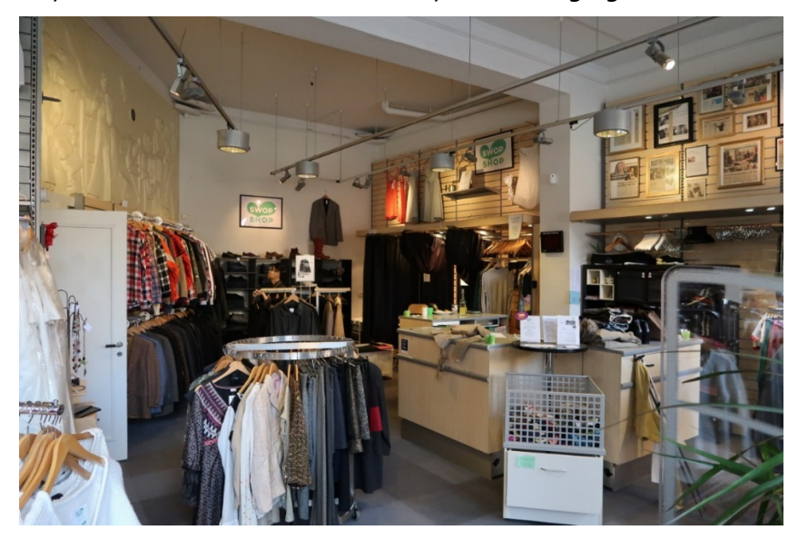
Figure 11. Swop Shop in Malmö

The motivations for establishing Swop Shop (Fig. 11) were based on personal experiences of the owner with buying, owning and sharing clothes. In particular, accumulation of dozens of kilograms of clothes in her own wardrobe stimulated the Swop Shop owner to explore new ways of consuming. The owner of the shop said that much had been learned while the shop was developing, its points system for swapping, and the ways to establish an alternative way of exchanging clothes.