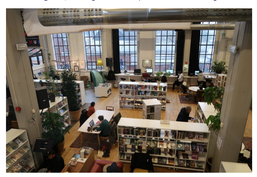
Figure 10. Inside Garaget library