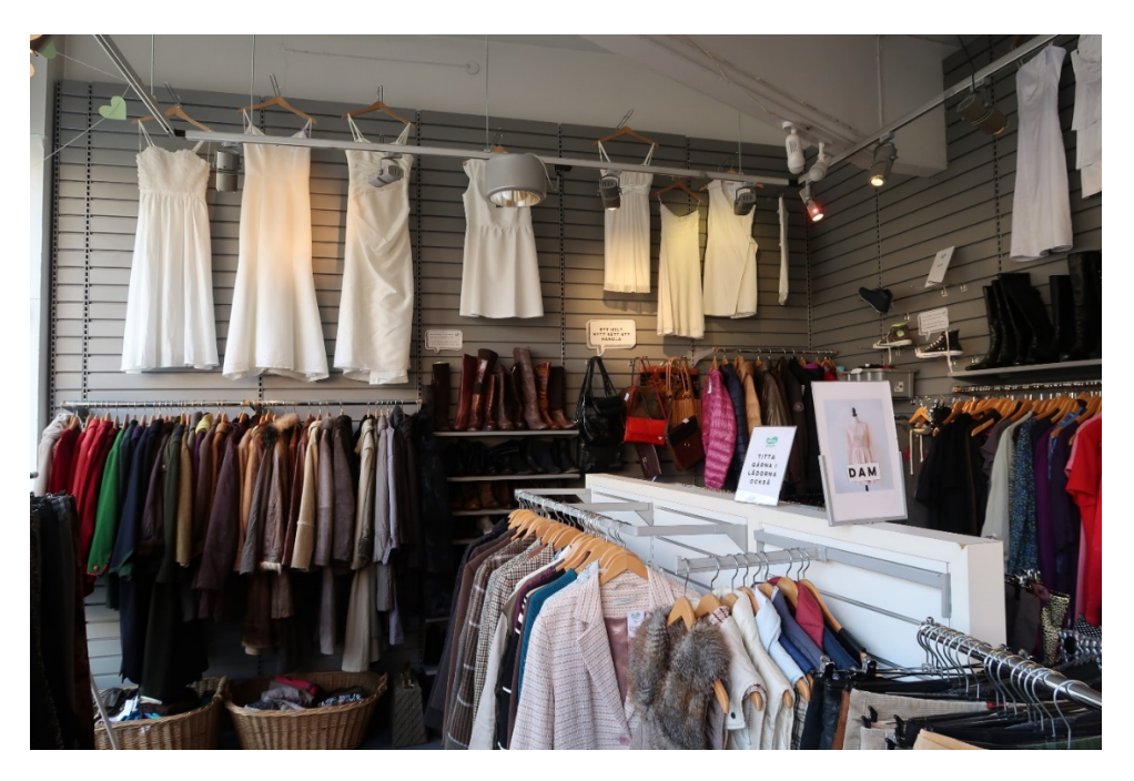
Figure 5. Swop Shop – a female clothes selection