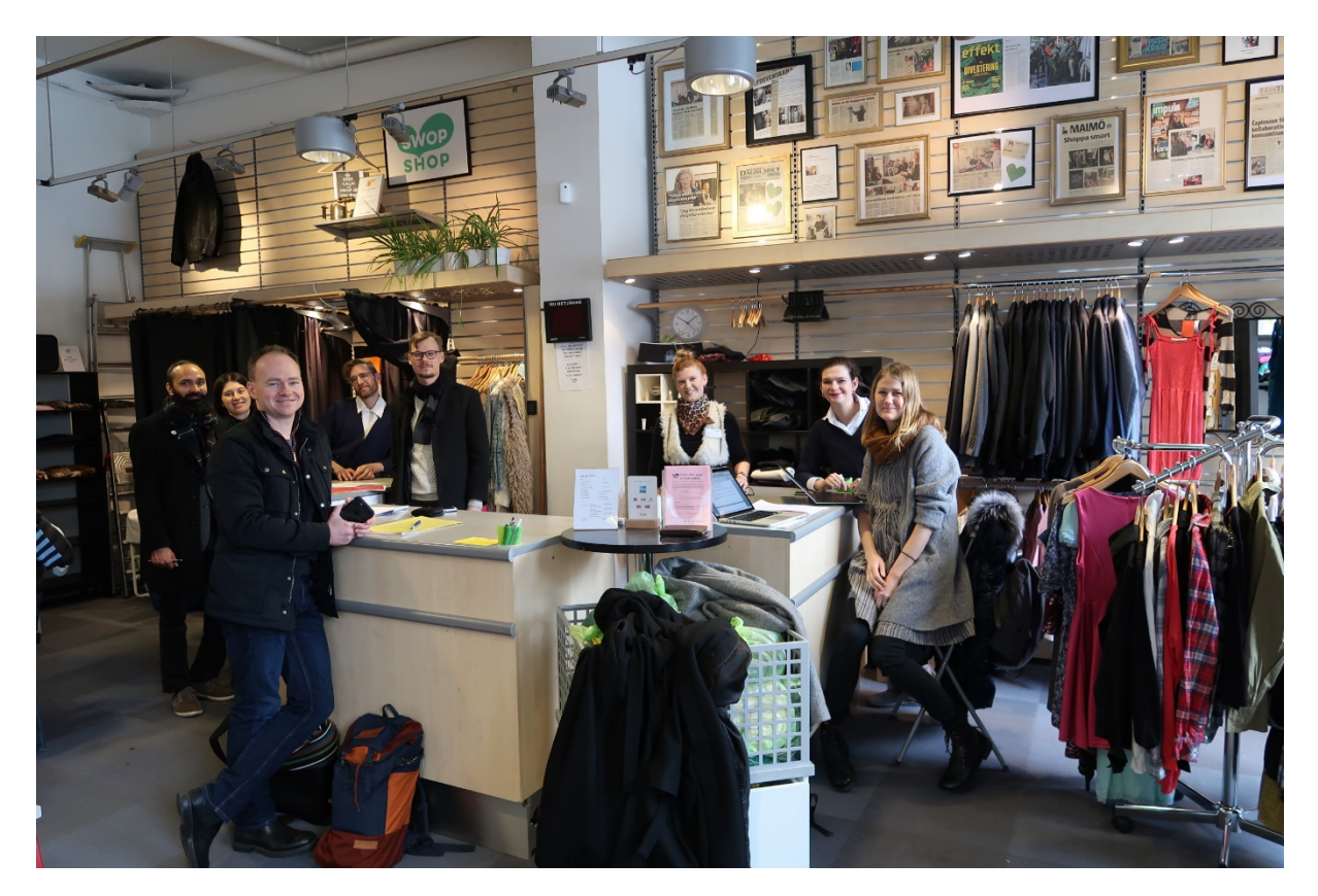
Figure 1. Mobile lab on Sharing in Malmö – visit to Swop Shop