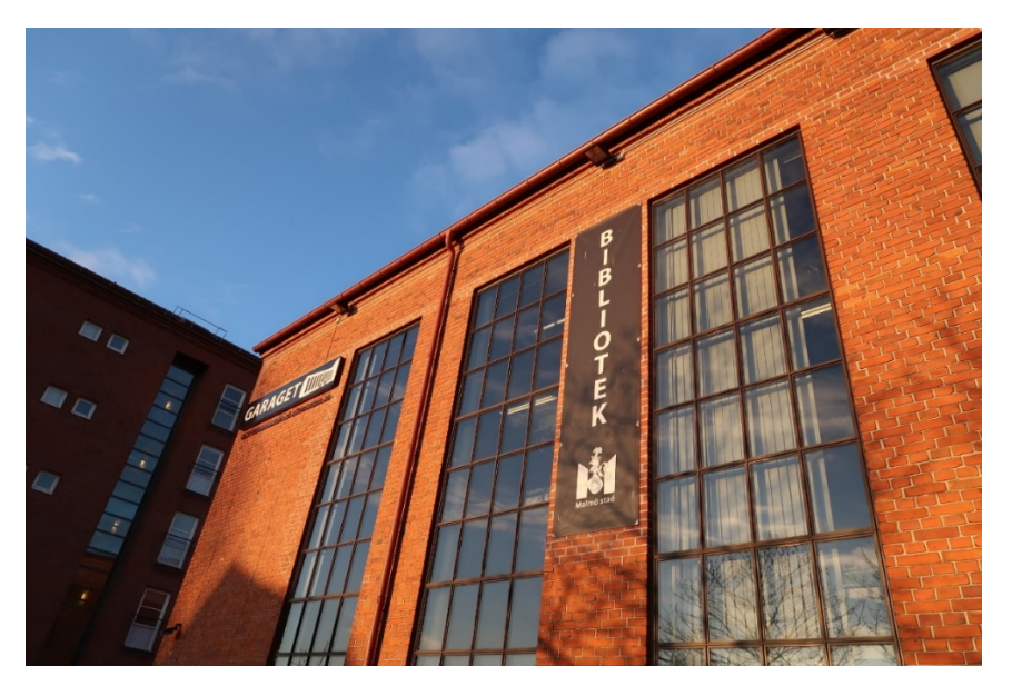
Figure 9. Garaget – a library for books and things

high share of immigrant population, low employment rates, low wages, and high crime levels). They also give their users the opportunity to volunteer, e.g. there are English and Arabic language cafes led by Garaget users on a voluntary basis. Garaget works with children to educate them on leisure time activities.