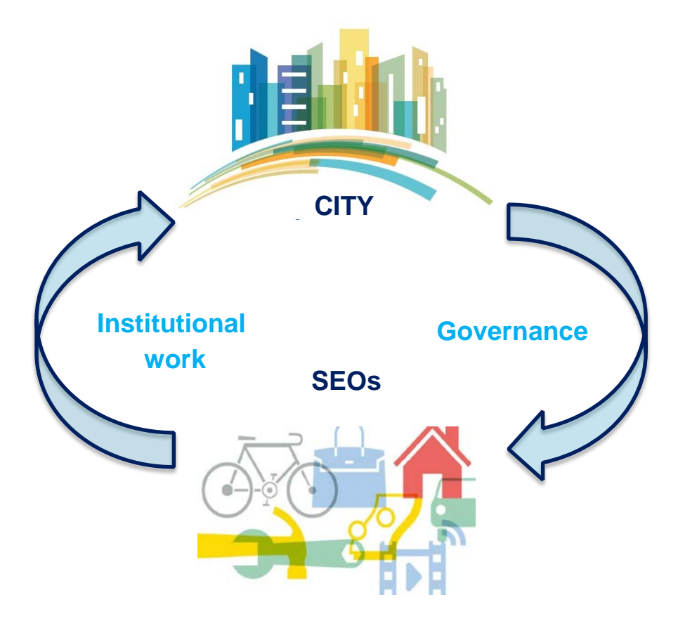
Figure 2. Dual urban sharing dynamics

Sharing in cities is becoming institutionalised through two principal sets of dynamic processes (Fig. 2). The first is a top-down institutionalisation dynamic when a city government employs its agency to promote or inhibit certain SEOs. To assess the roles that cities play when governing or interacting with SEOs, the Sharing and the City project has developed a theoretical framework. The framework identifies four major roles of cities: as a regulator, a provider, an enabler and a consumer (Fig. 3). It was tested on the case studies of London and Berlin (Zvolska et al. 2018; Voytenko Palgan, Mont, and Zvolska 2019), and refined during mobile labs in Malmö, San Francisco and Gothenburg.