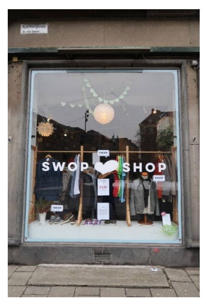
Figure 4. Swop Shop – a clothes swapping boutique in Malmö

According to the Swop Shop manager, attracting and maintaining customers is a challenge, as swapping is associated with a certain type of behaviour – "one has to be a swapper". Swapping requires time and attention, as it is very rare that a customer comes to the Swop Shop and finds a garment in the precise style and size, and "just what they want". The manager is optimistic about the future of swapping as, potentially, any consumer item can be swapped. However, she, thinks that "it will be at least five years more before this becomes common, if it doesn't speed up the municipality nudging people", so identifying the role of the City of Malmö in the sharing economy as important.