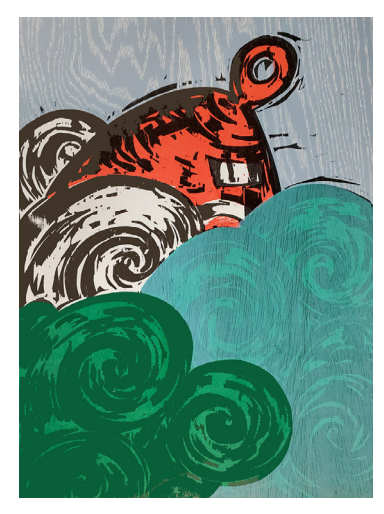
Yankee Roll, 2020. Woodcut and linocut, 25 1/2 x 19 1/2". Edition of 20