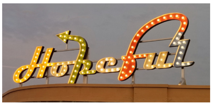
Hopeful, 2019. Painted colorfast aluminum and lightbulbs, 84 x 288 x 12"

1997 Vinalhaven Press, Portland Museum, catalogue by April Galant