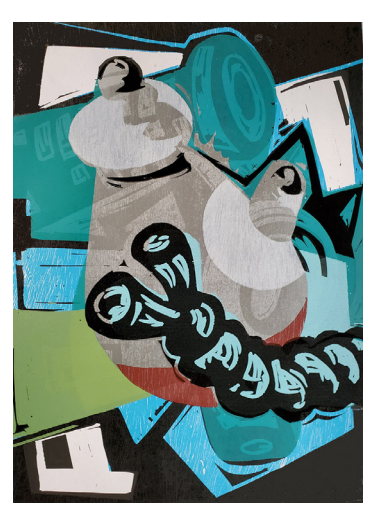
Tin Pot , 2020. Woodcut and linocut, 25 1/2 x 19 1/2". Edition of 15