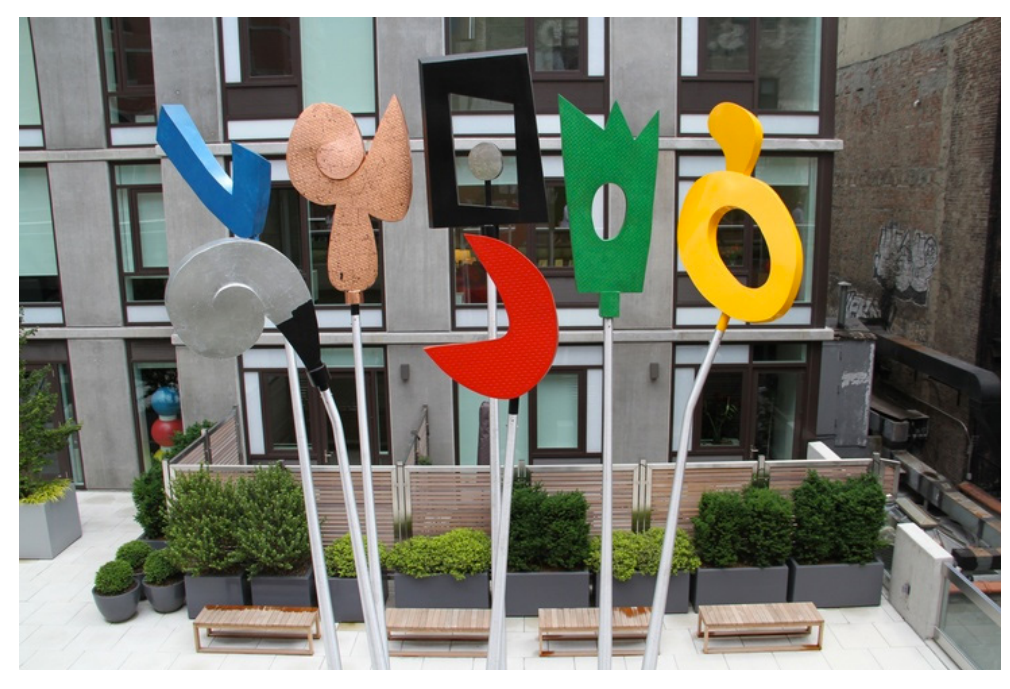
Urban Rattle, 2012. High Line Park, New York, NY