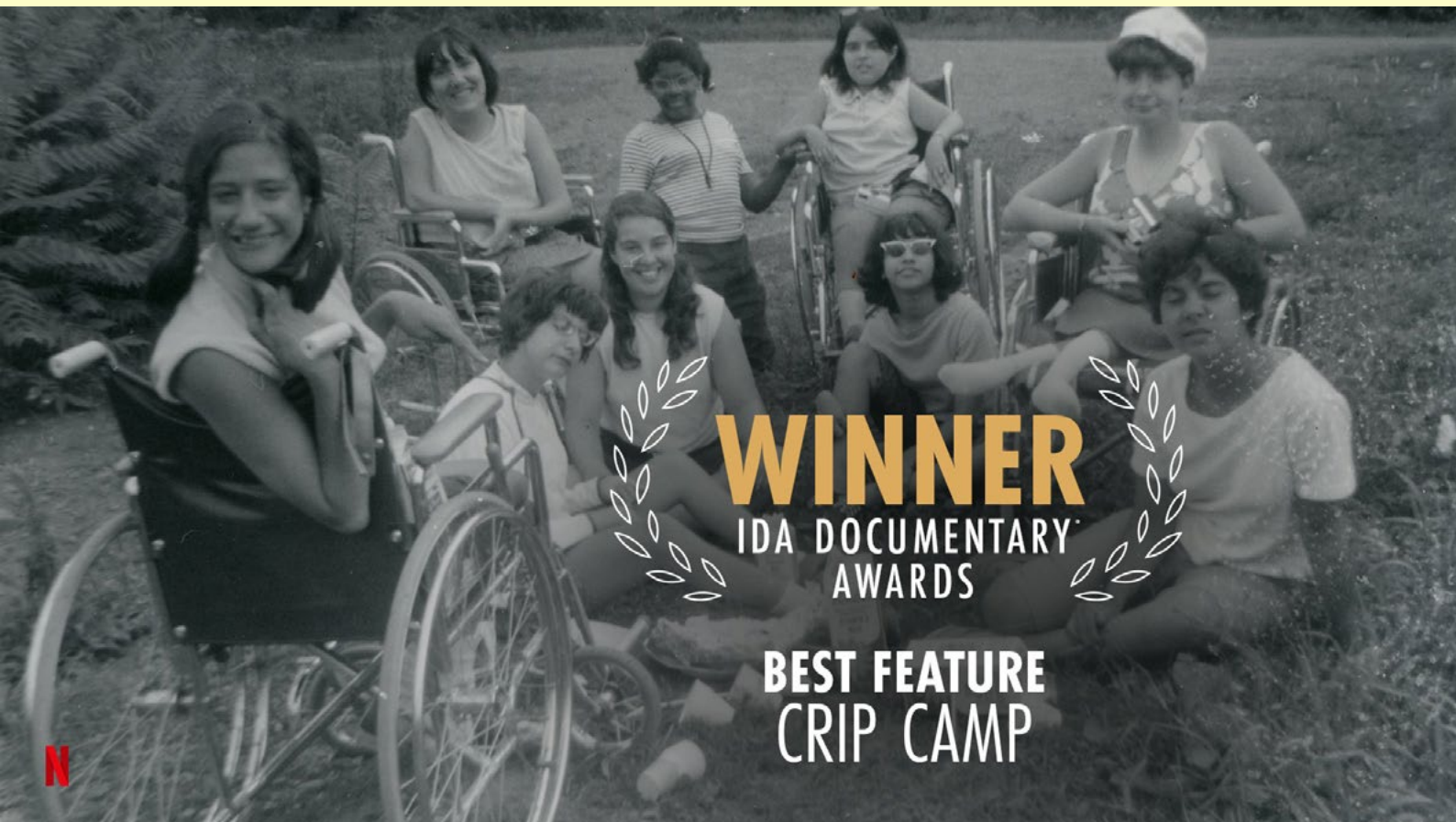
Image Description: A black and white photo from Camp Jened in the 1970s. Disabled teenagers, some in wheelchairs, some sitting on the ground, are in a circle and smile at the camera. Text overtop says 'Winner IDA Documentary Awards, Best Feature Crip Camp'.

– Jim LeBrecht, Co-Director of Crip Camp