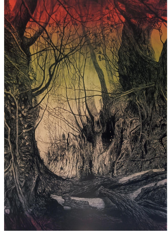
'Watching' by Stanley Donwood (limited edition of 10) - £7,000