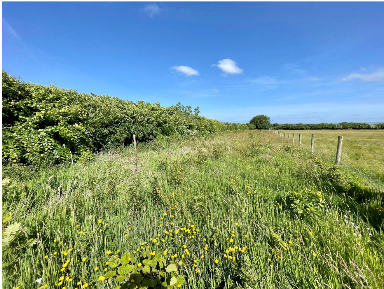
Devon trees and wildflowers at Farm Under the Radar