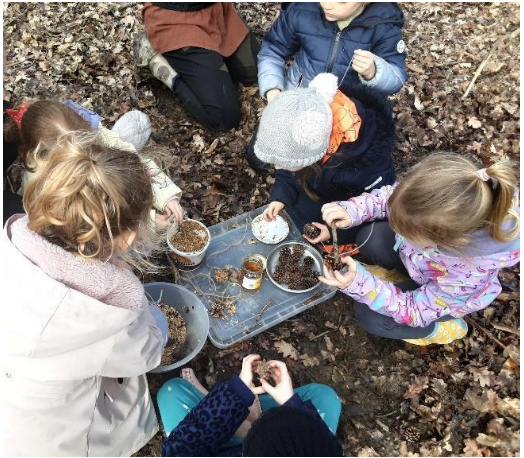
Forest tending days for the children at Springham Farm