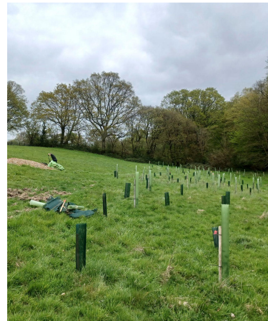
Springham Farm trees and maintenance