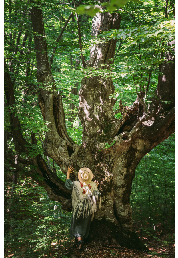
Beech forest by Marius Sumlea