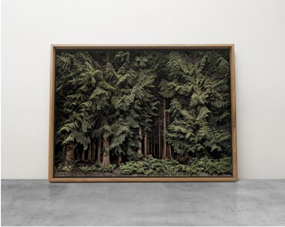
'Cedars' by Jasper Goodall - minimum bid £2,000

*Some items from the auction are still available for purchase as a creative way to support FWF. Limited edition t-shirts from Planet Loving Company created for and in collaboration with FWF are also available.