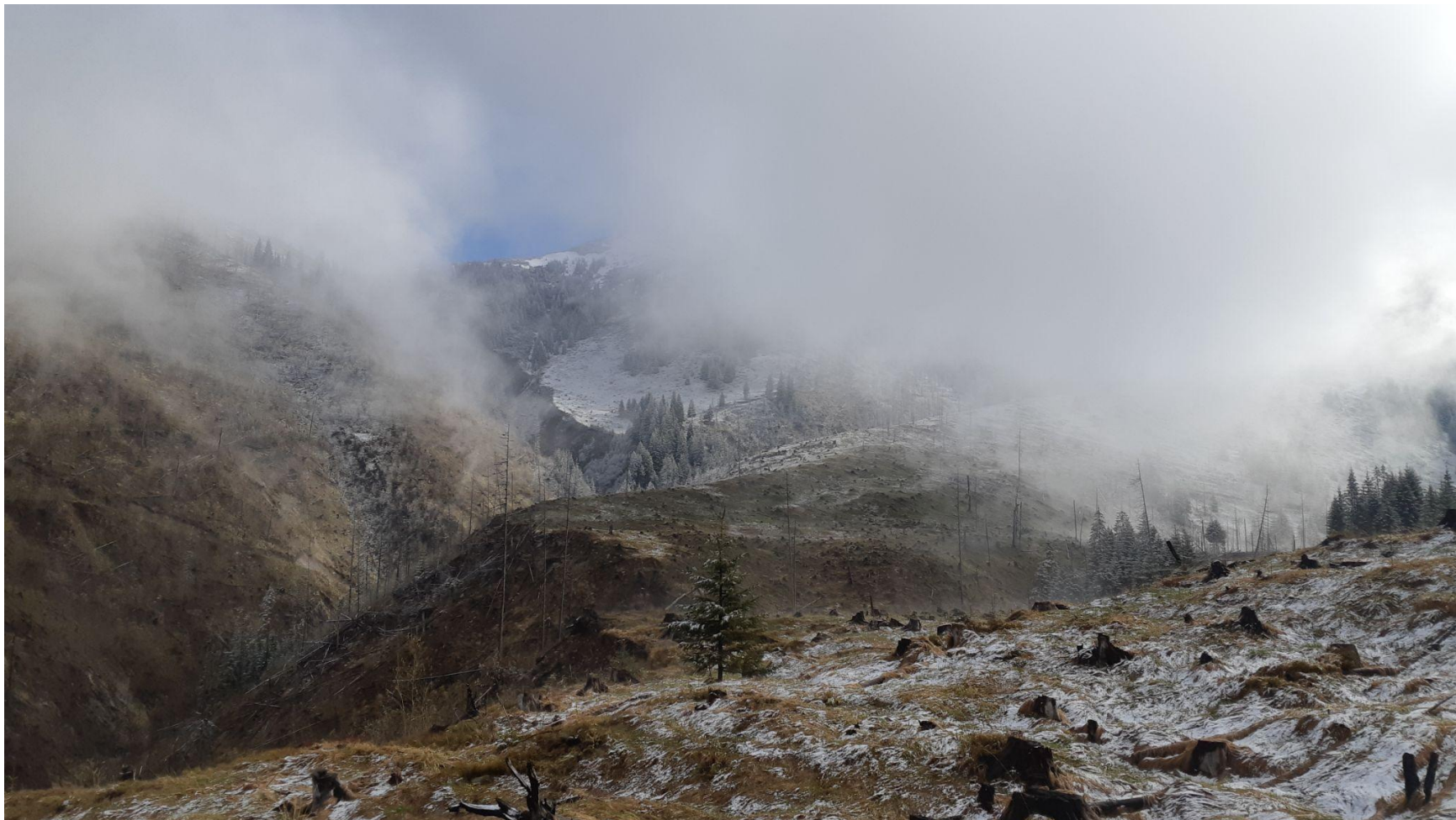
Groapele, Fagaras Mountains - planting site for spring 2023