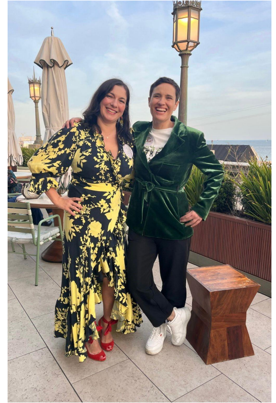
Soho Beach House Brighton Fundraiser