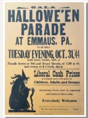
Halloween Parade Poster