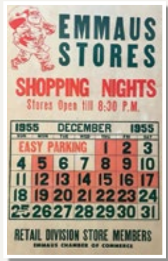
Shopping Nights Poster