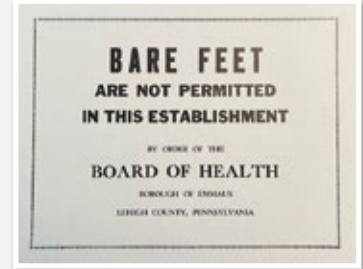
Board of Health Poster