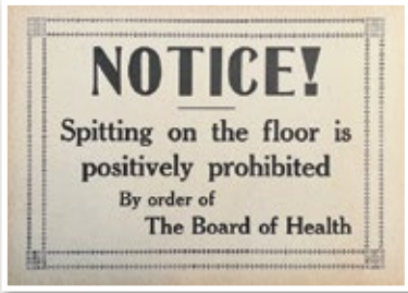
Board of Health Poster