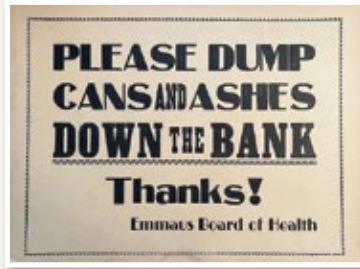
Board of Health Poster