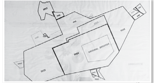
Map of Emmaus Annexations

The people of Emmaus have indicated by their actions their pride in this community which dates back more than two (now two and three quarter) centuries. That pride in the community and its heritage will, we believe, carry into the third century of America's independence and continue to keep this area a fine place in which to live. ☀