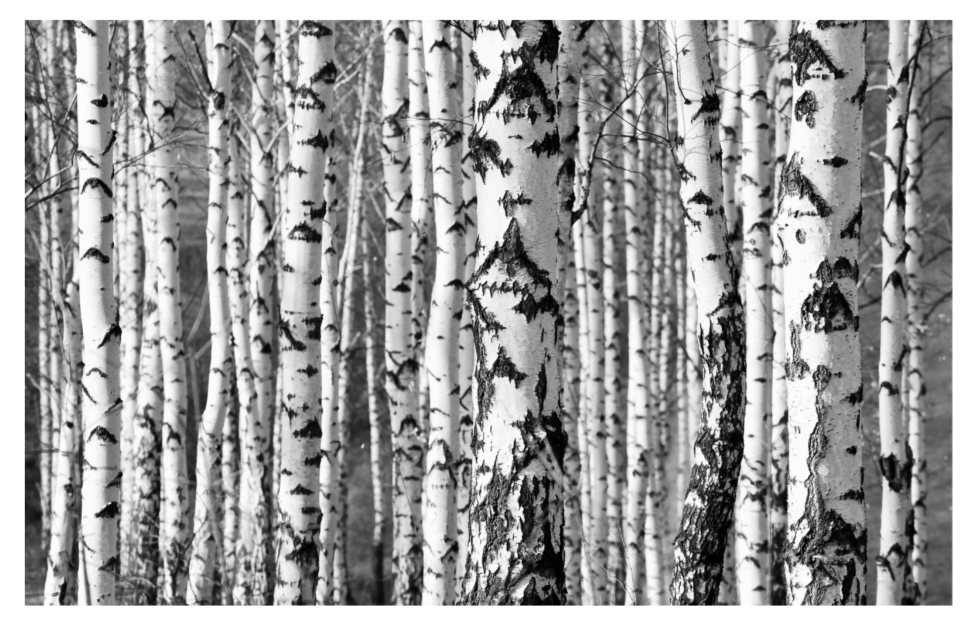
WELCOME | BIENVENIDOS Jan 30, 2022 | ONLINE WORSHIP LINK

Eden United Church of Christ is an LGBTQIA+ Open & Affirming and a Sanctuary congregation.