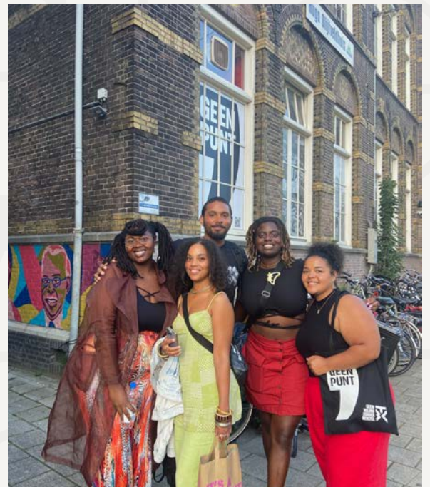
5 Black spatial practitioners from North Omaha visiting the Black Archives in Amsterdam, August 2023.