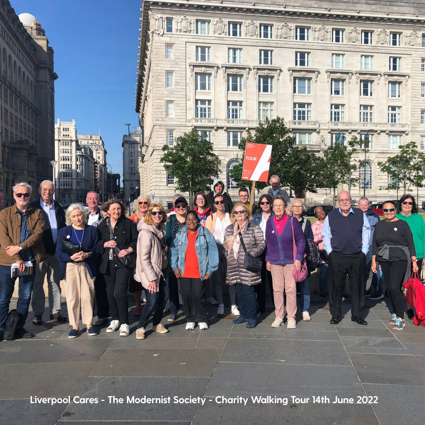
Liverpool Cares - The Modernist Society - Charity Walking Tour 14th June 2022