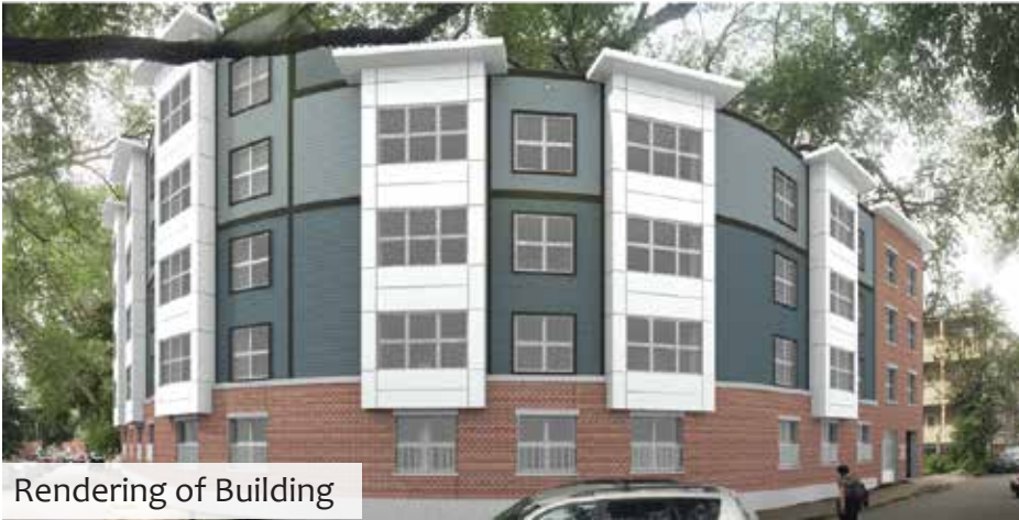
Rendering of Building

46 units of income restricted, elderly housing, ages 62 and older. All units are one bedroom (600 square feet).