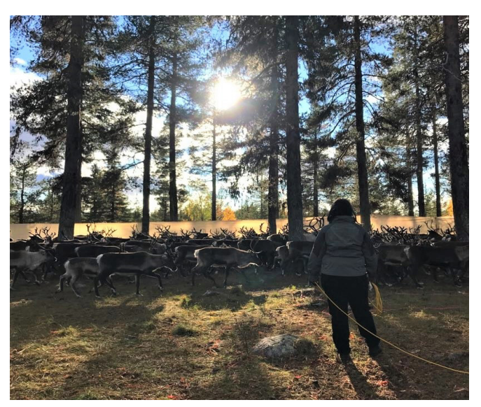
Autumn gathering in a forest reindeer herding community in Sápmi, Sweden

still belong to the same species, tundra reindeer, for instance, migrate between summer and winter pastures in the Arctic tundra while forest reindeer graze in the taiga woodlands throughout the whole year<sup>16</sup>. Today Motorcycles, snowmobiles and even helicopters are tools of assistance for some reindeer herders but there are also areas where innovative aid is scarcely available and herding is practised much like it has been for centuries<sup>17</sup>. This involves using reindeer sledges and also riding reindeer in some areas<sup>16</sup>. However, the value of the reindeer expands beyond being a source of subsistence. As a way of life and original civilization<sup>18</sup>, reindeer herding provides both a connection to ancestral roots as well as a communitarian relation to other reindeer herders across the Arctic. It has shaped original Arctic societies and constitutes the identity of many Arctic Indigenous Peoples.