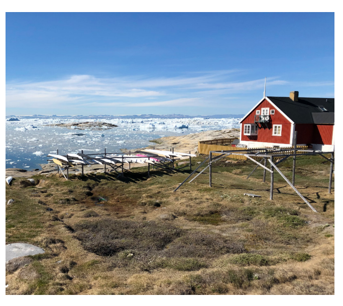
Kayak rack in Ilulissat, Greenland

For Arctic Indigenous Peoples, being part of the environment through sustainable hunting, fishing, reindeer herding, and harvesting has elemental cultural, social, and spiritual value. It is the understanding that ecosystems provide more than a connection to livelihoods. In many societies, terrestrial and marine mammals alongside humans are considered interdependent parts of the ecosystem. This holistic composition has a substantial impact on the adaptive capacities of Indigenous Knowledge. However, the single-species approach to resource management applied by dominant cultures is many times described as interfering with the balance Arctic Indigenous Peoples seek within the ecosystem. Some examples of this are the regulations on salmon fishing in the Deatnu river<sup>32</sup>, or the local quotas on beluga within Inuit Nunaat.