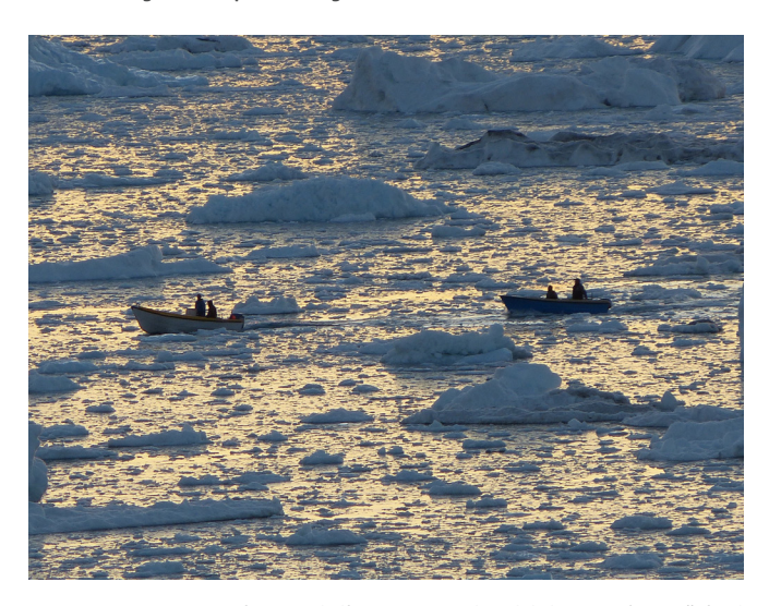
Hunters returning to Ilulissat, Greenland

The Inuit Circumpolar Council has underlined that it is essential to foster understanding on the importance of Indigenous Knowledge and holistic perspective to the environment within relevant national and international bodies in order to support, safeguard, and promote the overall social, cultural, economic, and political integrity of Inuit. The increasing need for understanding the changes in the Arctic therefore call for the co-production of knowledge, which means to employ Indigenous Knowledge and science together for better decisionmaking processes<sup>35</sup>. In comparison to dominant cultures, Indigenous Peoples have maintained ways of life that exist alongside Arctic ecosystems for thousands of years. Food, in particular, is an integrative part of the system surrounding Indigenous Knowledge and a source to socially and spiritually connect with culture<sup>36</sup>.