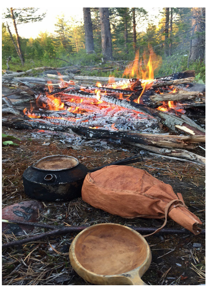
Hunting break campfire, Sápmi, Sweden

Yup'ik, Athabaskan, and Gwich'in Peoples have harvested salmon for at least 11.500 years<sup>43</sup>. Salmon, for Gwich'in, is both a food source and a way to explain life cycles of ecosystems through recurring appearances of fish<sup>44</sup>. In the Federal Republic of Sakha (Yakutia) in Eastern Siberia, home to indigenous Eveny, Yukaghirs and Evenki, food security and ways of life are becoming increasingly vulnerable through not being able to use traditional fishing practices due to environmental changes related to climate change<sup>42</sup>. Traditional food consumption also becomes more difficult for Inuit in Canada and Alaska facing climatic stresses. Alongside external regulations, unpredictable conditions such as longer periods of ice-break up, thinner ice, and lack of pack ice during the summer are all reasons for making traditional food less available. This cyclical change does not only affect the ways of life ultimately sustaining indigenous livelihoods, but also connects to individual and collective well-being.